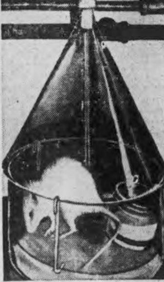
NO PRIVACY For 'This Rat

The steer experiment is said to be the only one of its kind in this country. Previously, such calculations could be made only by putting the animals in respiration chambers and going through an expensive laboratory process.