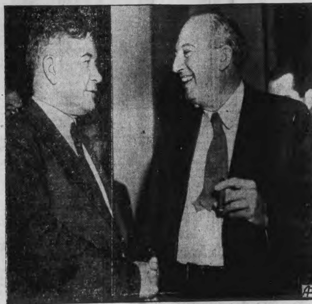
By a one-vote margin of 38 to 37 Senator Alden W. Barkley of Kentucky was elected Democratic leader in the senate, succeeding the late Joseph T. Robinson of Arkansas. One of the first to reach his side after the election was the defeated candidate, Senator Pat Harrison of Mississippi. Smiling broadly, Harrison (right) is shown pledging his support to Barkley.