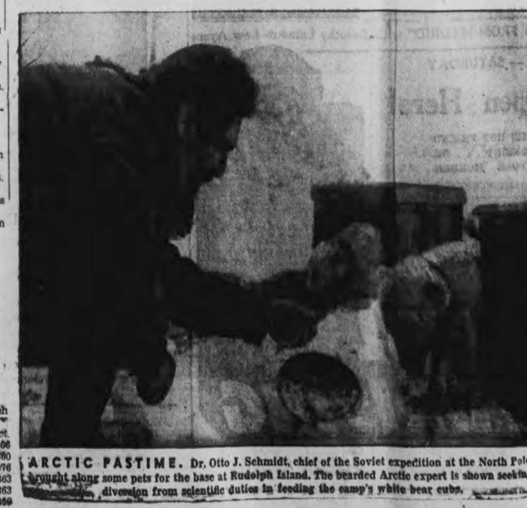
ARCTIC PASTIME. Dr. Otto J. Schmidt, chief of the Soviet expedition at the North Pole, brought along some pets for the base at Rudolph Island. The bearded Arctic expert is shown seeking diversion from scientific duties in feeding the camp's white bear cubs.