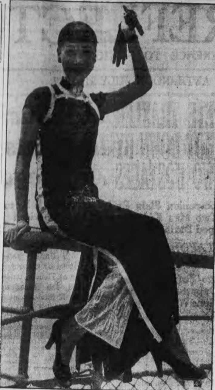
HELLO PLEASE. Anna May Wong, Chinese movie star who was born in Los Angeles, came back home from a European jaunt on the big ship Normandie. Her "native" costume, plus high heels and gloves, are shown with this greeting from Anna May.