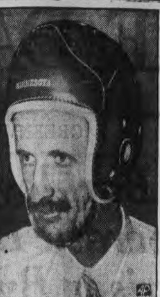
HEADING UP. Prof. Jean Piccard, stratospherist, borrowed a Minnesota U. gridiron chapeau in preparation for his "balloon cluster" ascent. He proposes to use eight small inflated bags.