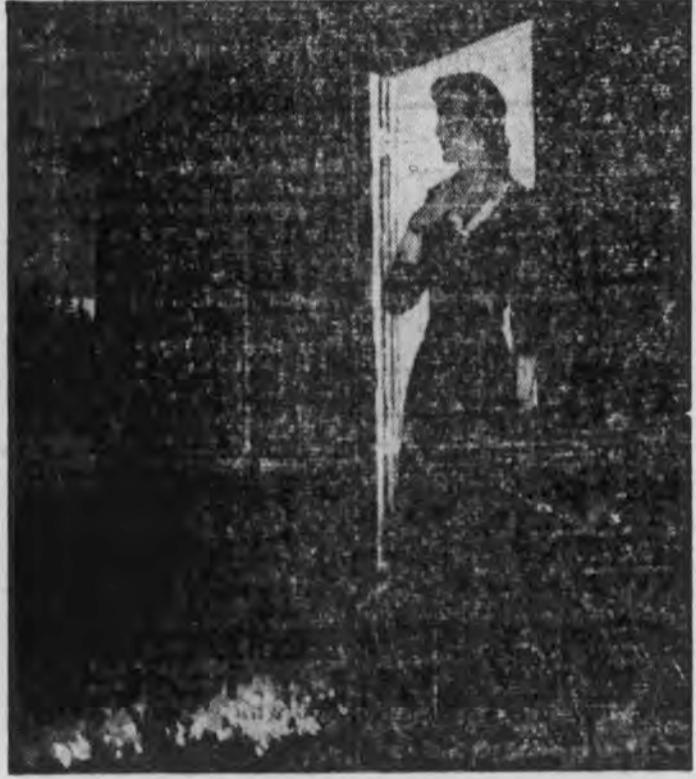
The dark haired girl appeared in the doorway.

The next instant, the willowy figure of the dark haired girl appeared on the steps of the cabin. She stood for a moment in a listening attitude, and Kay had an