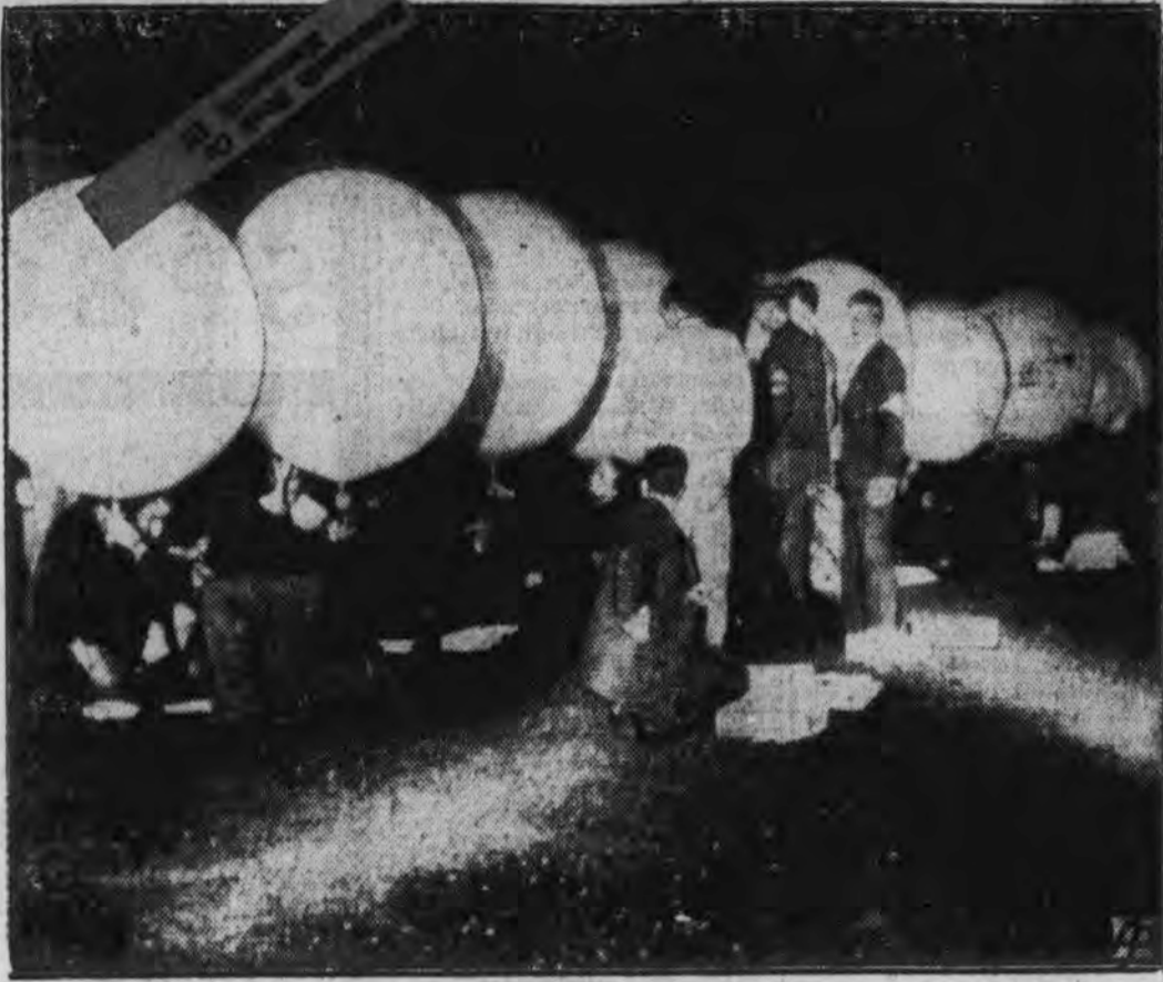
This picture shows members of the ground crew inflating some of the 80 latex balloons that carried Dr. Jean Piccard into the stratosphere from Rochester, Minn. He ascended just a few moments later but his precarious venture ended unhappily when he crashed in flames. He escaped injury but his equipment was destroyed.