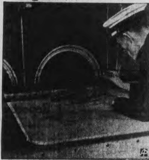
IN AN AIRLINER

Look at this instrument-pocked control board in Amelia Earhart's plane — and you'll see what a job it was for only two persons — Miss Earhart and Navigator Fred Noonan — to keep tab on everything. (Note radio sending key at right.)