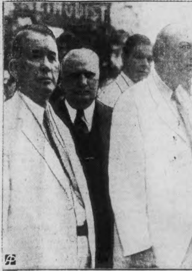
Senators Barkley (left) of Kentucky and Pat Harrison (right) of Mississippi, rival candidates to succeed Senator Joseph T. Robinson as Democratic leader, are shown at Robinson's funeral in Little Rock. Between them stands Senator Dietrich of Illinois.