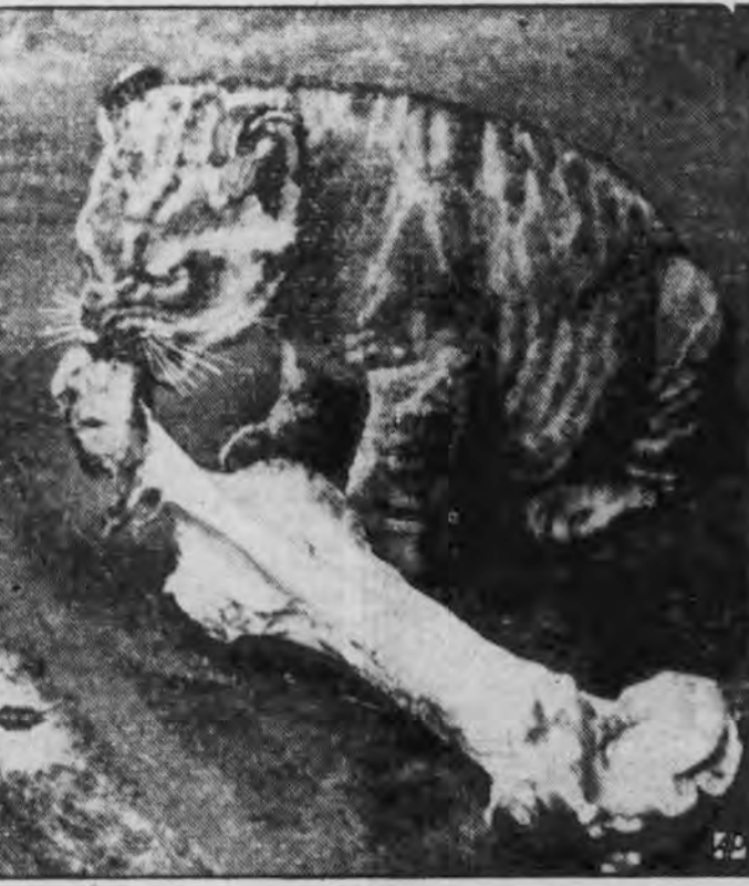
TOUGH KITTY. It's "Climax," lion cub of "Joek" and "Juno," big cats in the London zoo. The bone seems a bit large for such a little cat, but food of any size looks good to a jungle kitty.