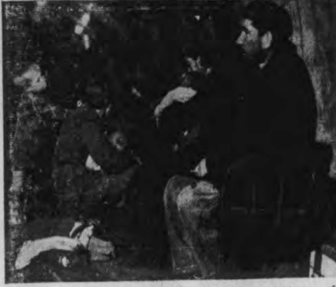
2—THEN WAR SHOWED ITS UGLY SIDE. In a nightmare of screaming shells, the tots dropped their wooden guns and fled with harried mothers to refuge. In Madrid, they huddled in the subway; elsewhere they clustered in open fields and caves.