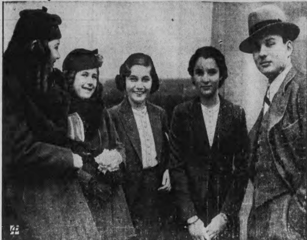
King Farouk Of Egypt With (L. to R.) Sisters Fawziya, Faiza, Faika and Fathiya.