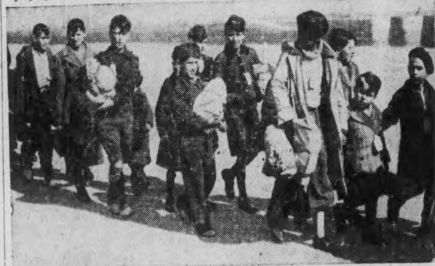
4—NOBODY WANTED TO PLAY SOLDIER AFTER THAT. The big boys—only in their teens—have taken up their dead fathers' weapons. But the younger children's one thought has been—escape. Many, especially the Basques, have been taken to England; others, like this group, found refuge in France.