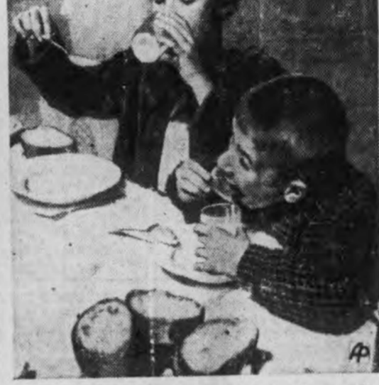
5—SAFE AT LAST in a foreign land, they wolf down food, learn to laugh again, play peace-time games. But many will never see their parents. These tots have already lost the war.

gress up and beautify in every way possible.