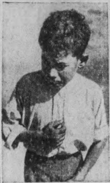
1—WAR WAS FUN at first for many Spanish children. Babes in arms became babes with arms playing soldier for fun.