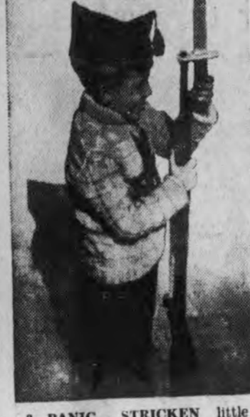
3—PANIC—STRICKEN little boys who would ordinarily be in school suddenly found themselves orphaned.