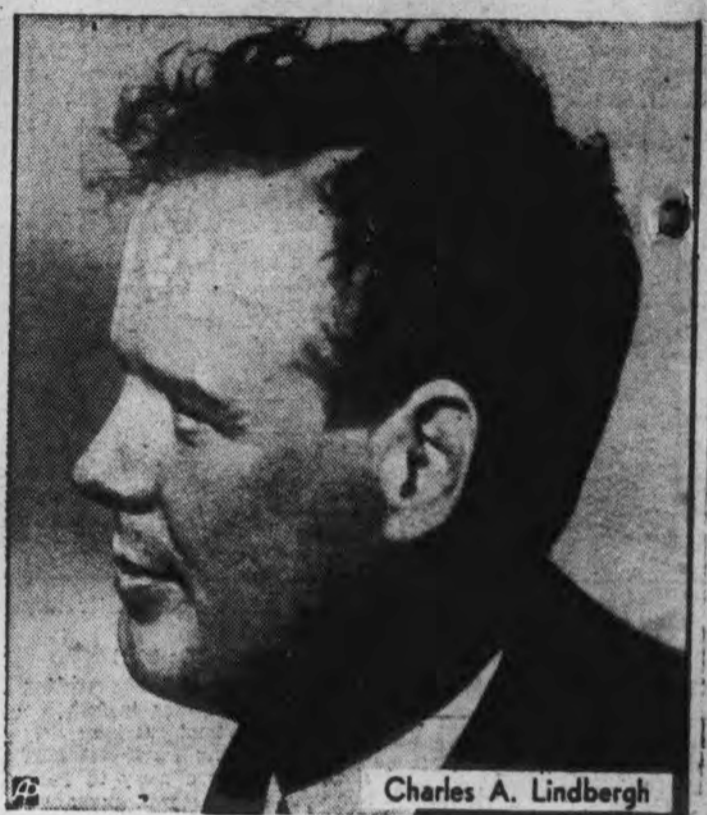
Charles A. Lindbergh