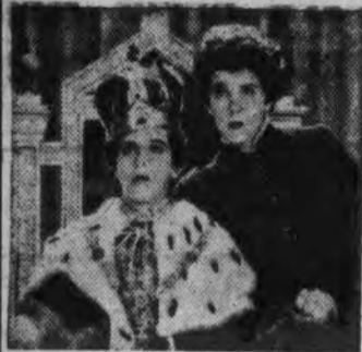
The Mauch Twins in "Prince and the Pauper", Sun.-Mon.