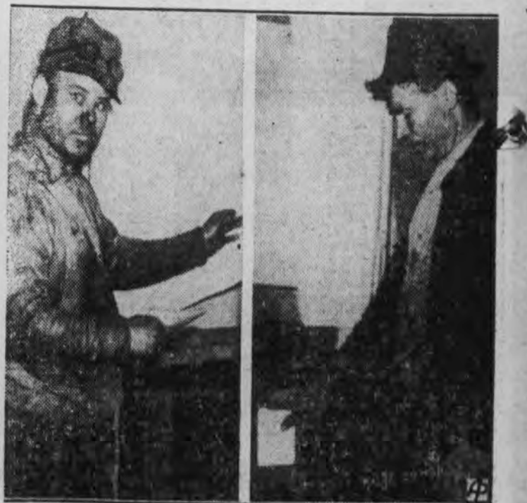
The Steel Workers Organizing Committee of John L. Lewis won by a better than two to one margin in the balloting of 24,412 workers of the Jones and Laughlin steel corporation at Pittsburgh in the biggest industrial election ever supervised by the government. This means the union will deal for the workers with the company. Here are two typical steel workers voting.