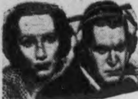
(Left) Miriam Hopkins in "The Woman I Love," Wednesday-Thursday.