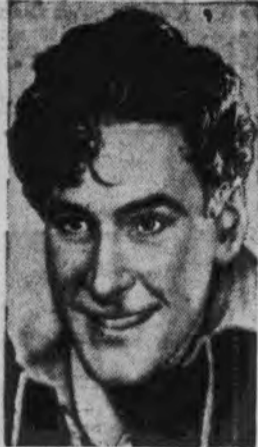
Errol Flynn in "The Prince and the Pauper".