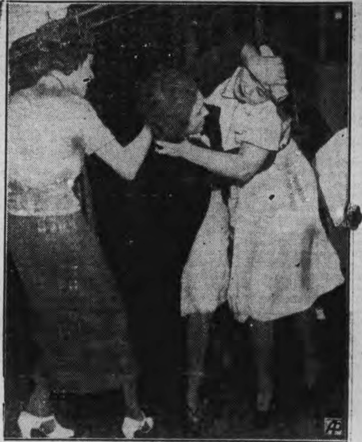
Face-scratching and hair-pulling greet efforts of the Ladies' Garment Workers Union to organize the employes of the Majestic Manufacturing company, Inc., in Atlanta. Here are two battlers hard at it during the fight between union pickets, union organizers and employes of the concern.