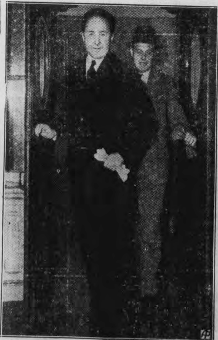
Hans H. Dieckhoff (front), new Nazi ambassador to the United States, shown visiting the state department at Washington, told newsmen he had presented an informal protest against Cardinal Mundelein's criticism of Chancellor Adolph Hitler, and that so far as he was concerned the incident was closed.