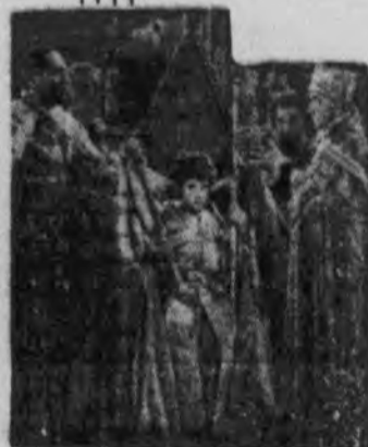
See a new king crowned in London... The same ceremony a million people crowd the world to see!