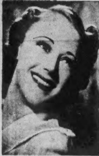
Charming Sally Eilers stars in "We Have Our Moments," coming Tuesday.