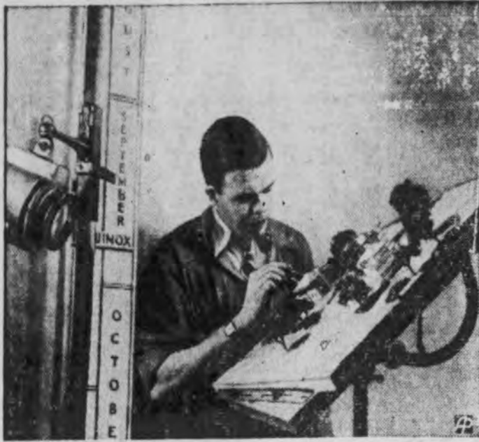
SUN FORECASTER The heliodon shows the home builder how much sunshine he can expect in September.