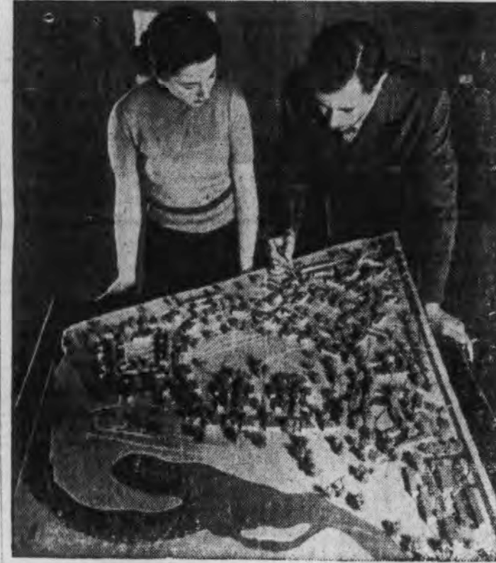
BUILDING "SPACER" The heliodon also tells the town planner how far apart houses should be in a community.