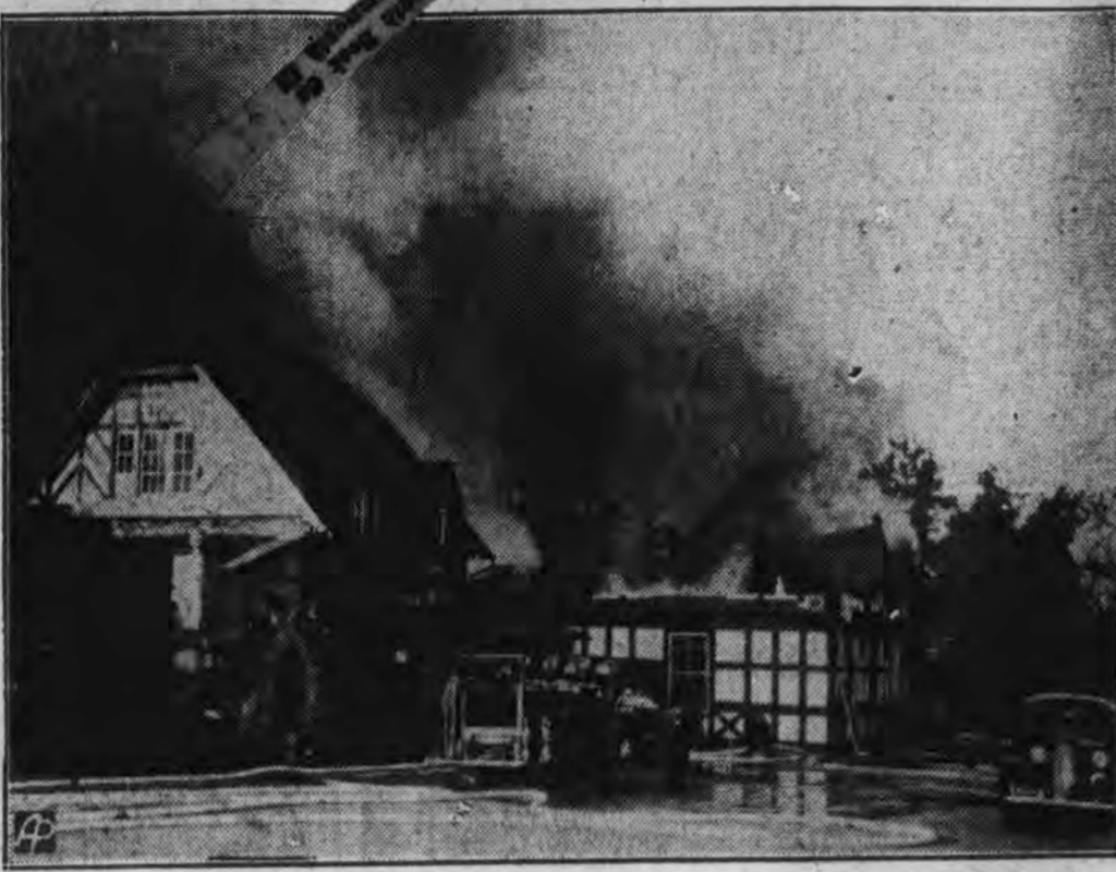
The Piedmont Driving club, gathering place of Atlanta's smart set for generations, was damaged badly by flames that swept the north wing of the historic structure. The loss was estimated at $75,000 to $100,000 by Superintendent Guido Negri. This picture was made just after a section of the roof caved in.