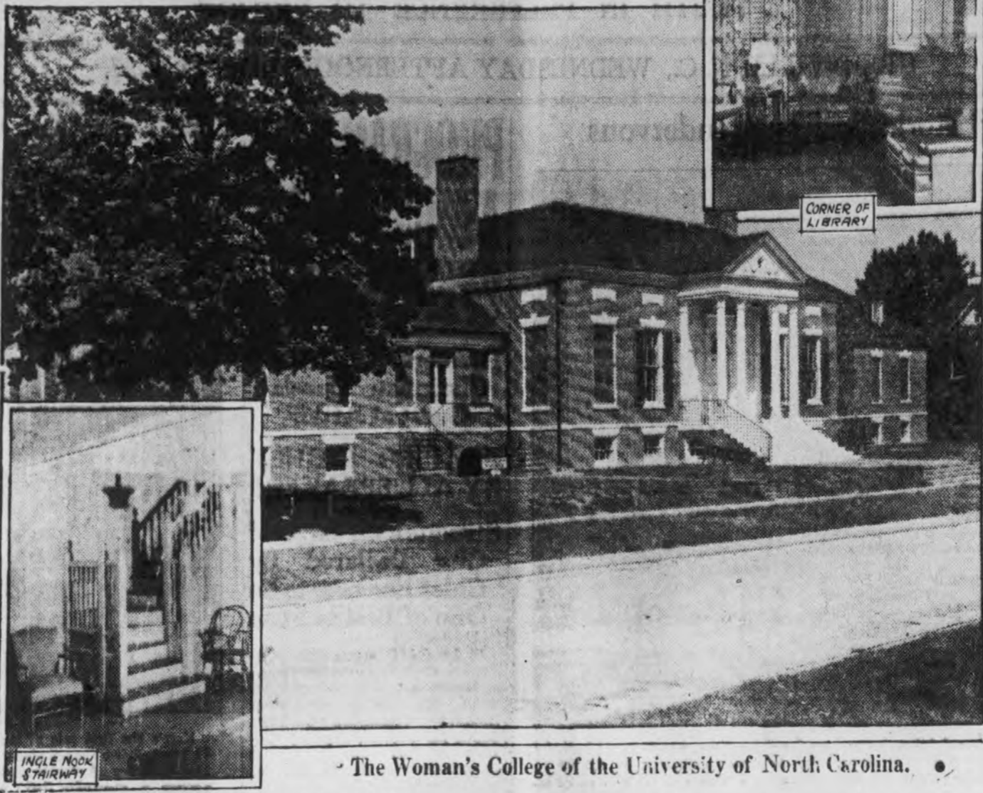
The formal opening and dedication of the new Alumnae House at the Woman's College of the University of North Carolina will feature the four-day program in connection with the 45th commencement of the College June 4-7. The dedication service is scheduled for Saturday morning, June 5, at 11:15 o'clock, on the lawn in front of the House, shown above.