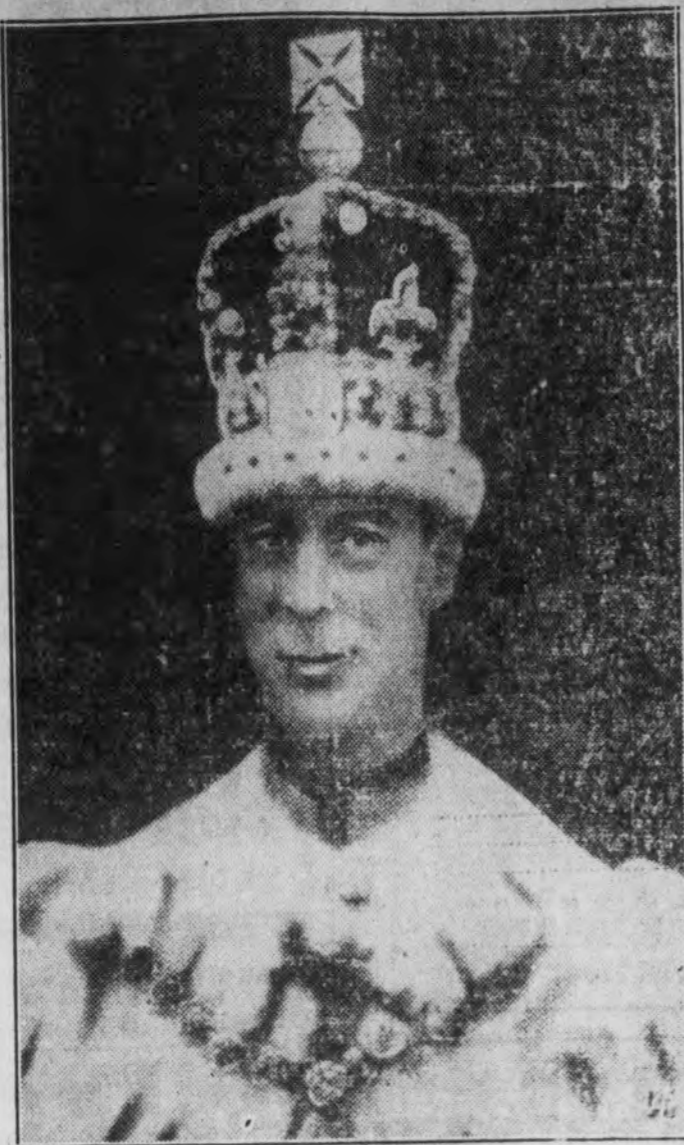
Wearing his new crown and garbed in ermine and velvet, King George VI smiles down from the balcony of Buckingham Palace while two million persons rock London with the cry "God Save the King." Several times the youthful king, who rules over Britain's half-billion subjects, was called back to the balcony to acknowledge the peals of cheering throngs. This picture was radioed to America from London.