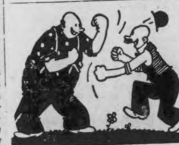
The Morning After Taking Carter's Little Liver Pills

AS CHEESE-EATERS, EUROPEANS BEAT AMERICANS Washington, (AP)—Americans are improving but still behind Europeans as cheese eaters. Agriculture department cheese