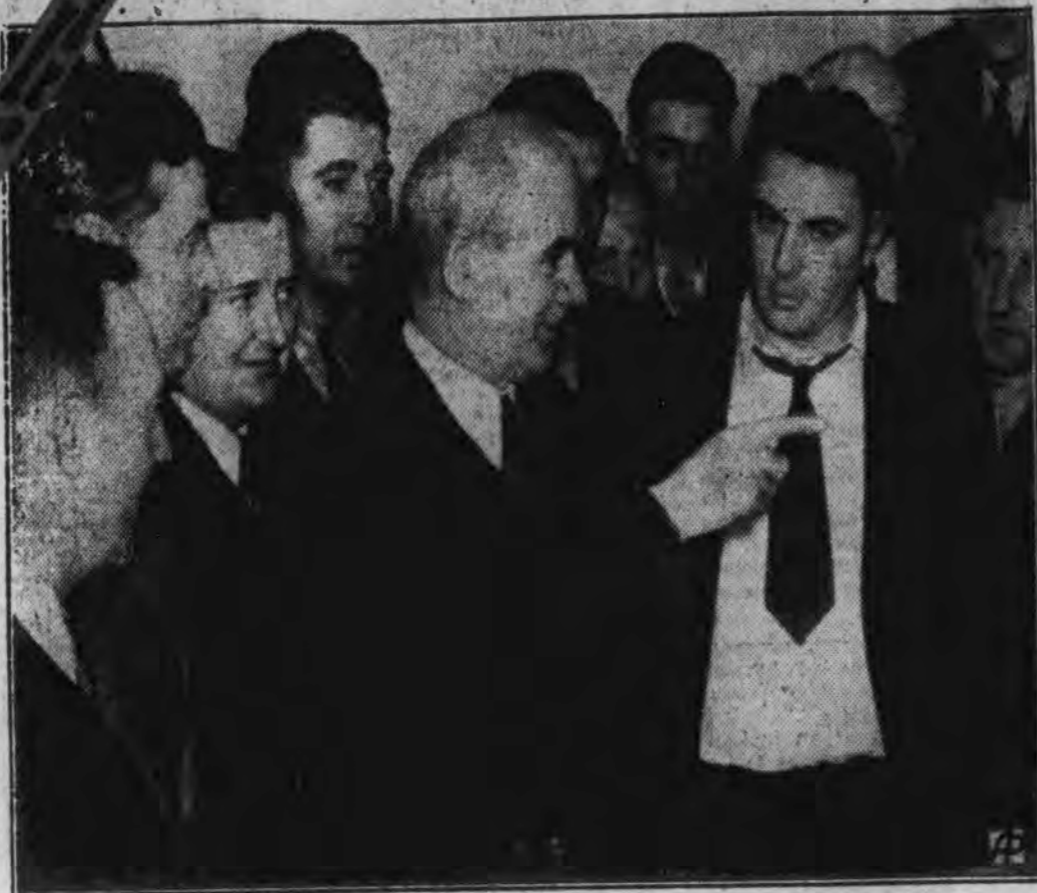
The nation's first major steel strike since John L. Lewis set out to organize the mill workers was declared as Union Leader Philip Murray (upraised hand) announced a strike call to committee workers against the Jones & Laughlin Steel Corporation at Pittsburgh. Twenty-seven thousand men were affected by the strike order.