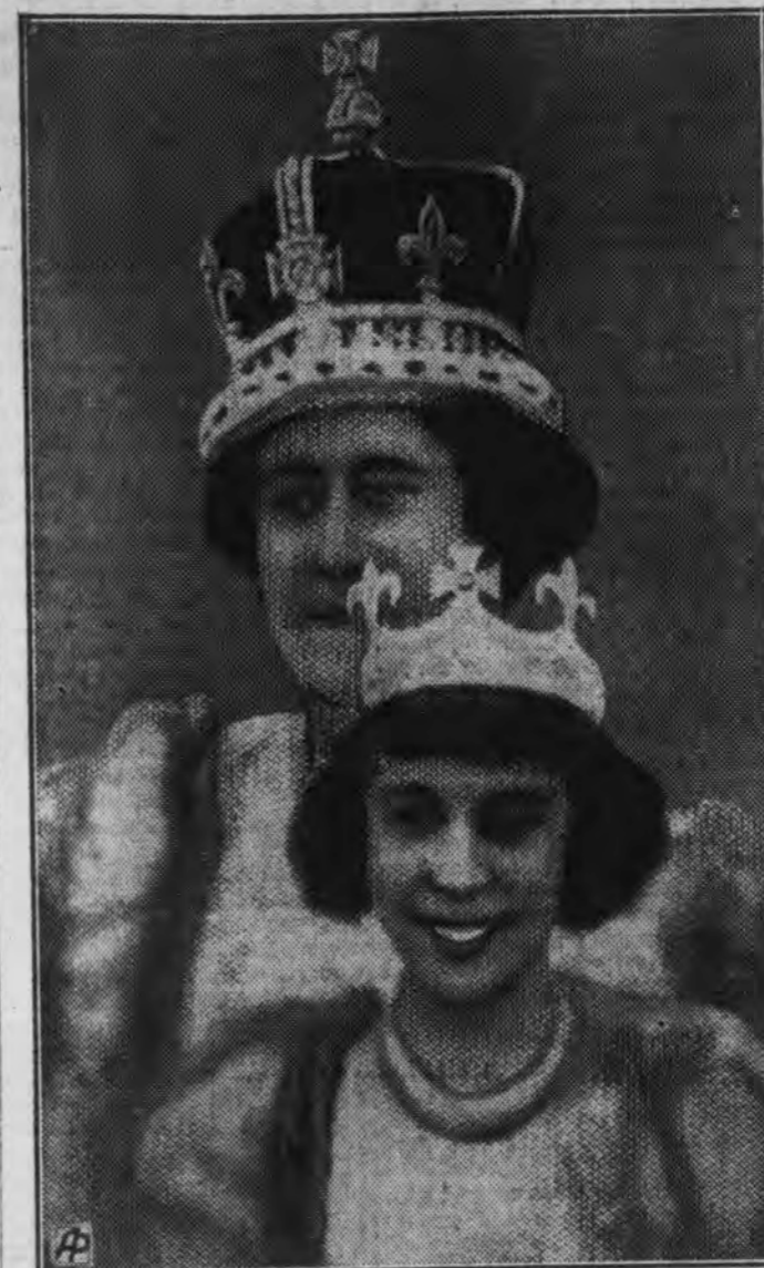
Britain's new Queen Elizabeth and Queen-To-Be Elizabeth, wife and daughter of King George VI, are shown in this radiophoto smiling and waving from the Buckingham Palace balcony to thousands of cheering Britons. Born a Scottish commoner, Queen Elizabeth is wearing her new crown of gold. Princess Elizabeth, 11-year-old heiress presumptive to the throne, was queenly and stately throughout the coronation.