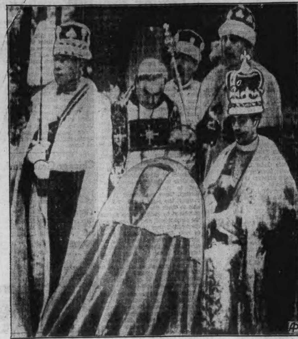
This, the first picture made showing King George VI wearing his crown after the coronation, shows one of a long line of peers as he knelt before the new ruler. The photo was transmitted from London to New York by radio.