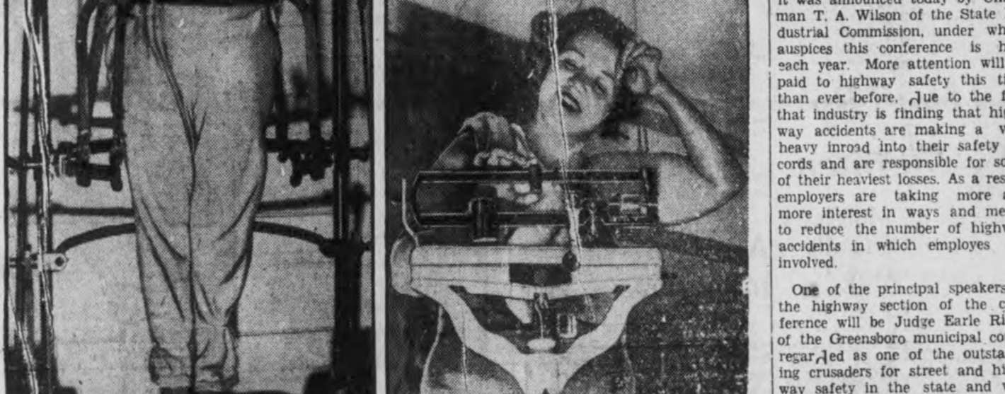
WEIGHING IN at workout's end tells the subject what progress the waist spring and shoulder rollers (left) made on the bulk.

Boasts one woman, who doesn't like to divulge her weight: "I've already lost 15 pounds and haven't been in training long I'm so proud."