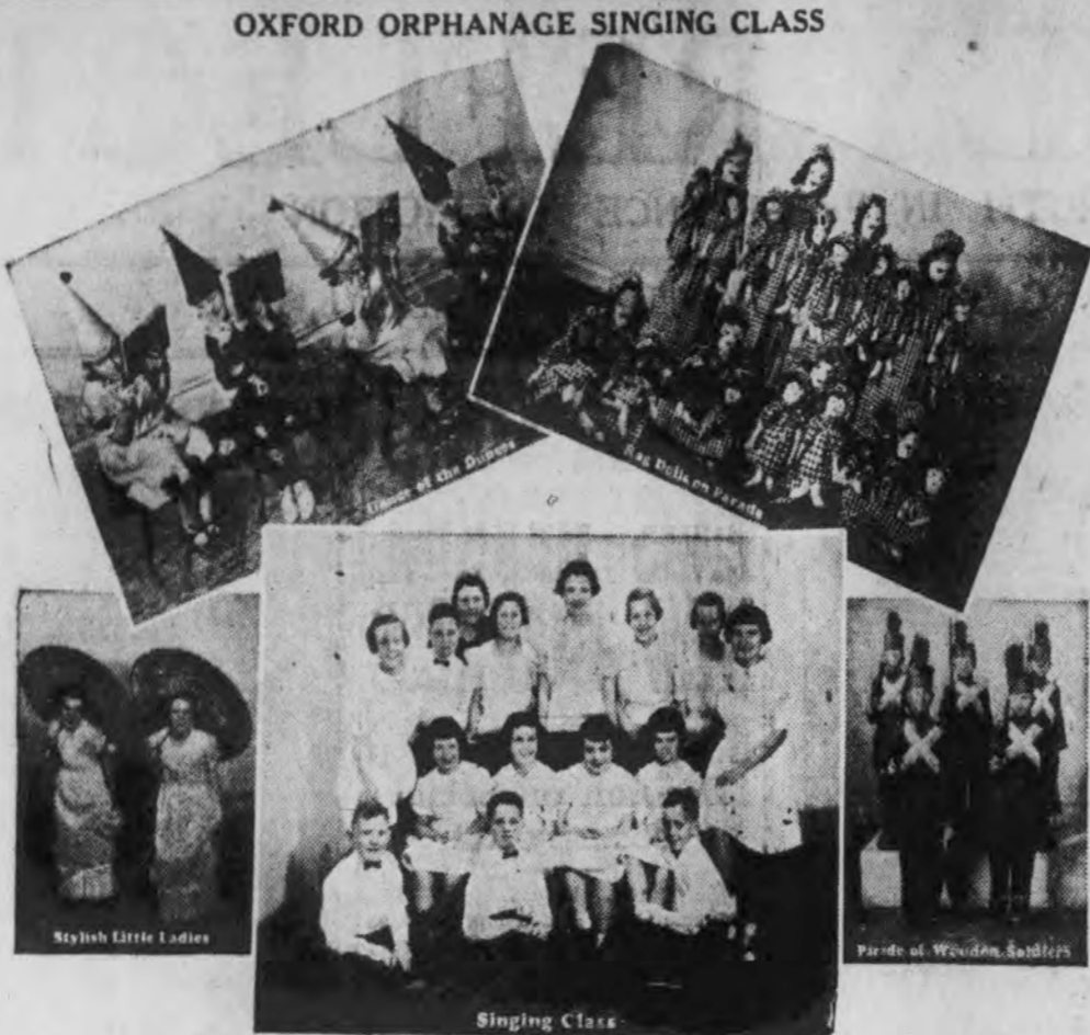
The Singing Class of the Oxford Orphanage will present a concert in the High School auditorium on Tuesday evening, May 11th, at 8 o'clock.