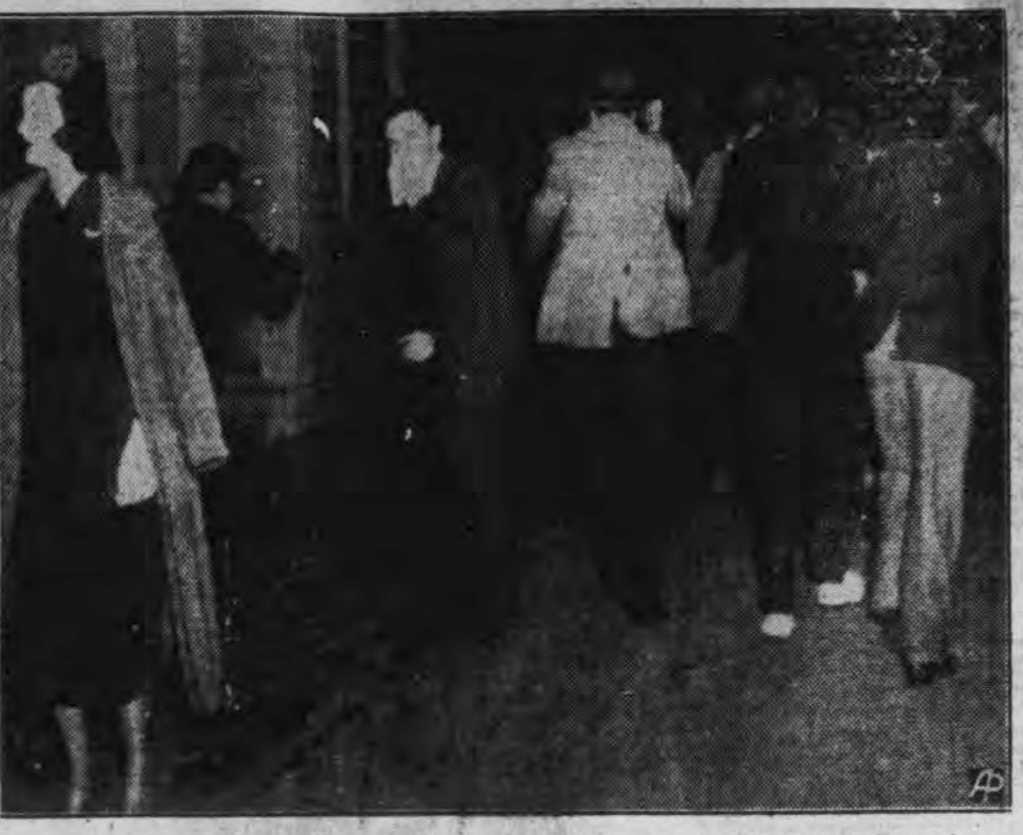
Tear gas bombs were thrown and one youth was arrested in a student-police clash on Harvard campus, following attempts of officers to stop merry-making pranks in the form of egg tossing and the hurling of bags filled with water. Students are shown retreating before the tear gas with handkerchiefs to their noses and their coat collars turned up. The girl at the left doesn't seem to mind the gas.