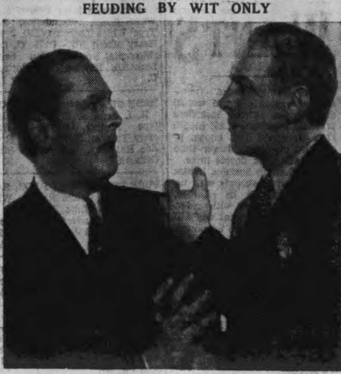
Emphasizing remark No. 999, we have Walter Winchell and Ben Bernie, continuing their feud in "Wake Up and Live", opening at Pitt Sunday.