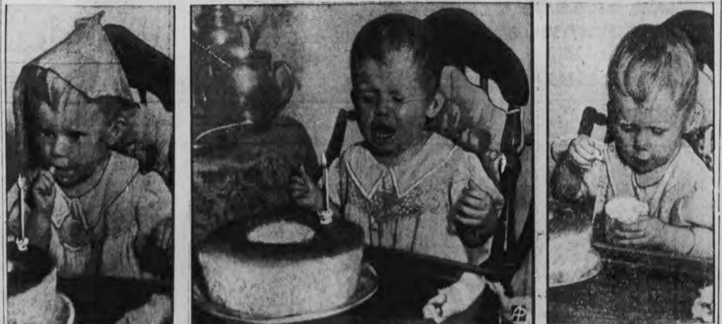
BIRTHDAY NO. 1 "Now what's that?" this young lady would ask if her folk were as candid as this photo.