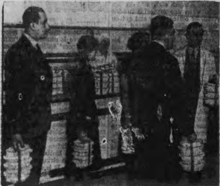
FAMILY DINER Answer to a housewife's prayer are the central kitchens in Budapest where you can either drop by and pick up the family dinner ready to serve or have it delivered by bicycle.