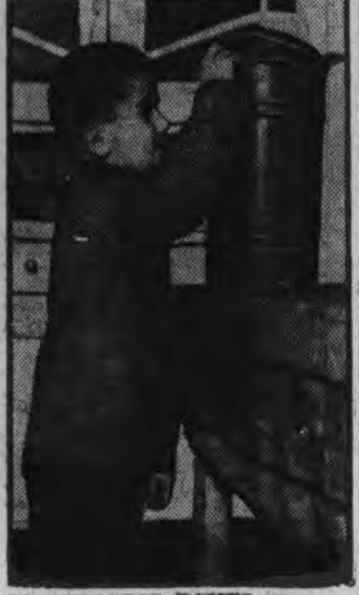
TO BUDAPEST HOMES And there's always a warm welcome waiting in mama's unused kitchen from hungry Hungry Fritzels.