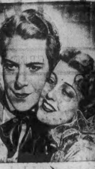
NELSON EDDY and JEANNETTE MACDONALD, the world's singing sweethearts, in "Maytime," playing at the Pitt today, Sunday, Monday.

WE GUARANTEE WATCH REPAIRING— JEWELRY REPAIRING— Englaving—Reasonable Prices LAUTARES