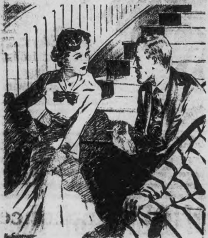
"Well, Don Juan, I suppose there's some reason for this stupid stunt!"

"Skipper," he said, "you're always right." And informing Gay that she would mold if she sat there another moment, he steeled her from the room, leaving me to follow with Jude.