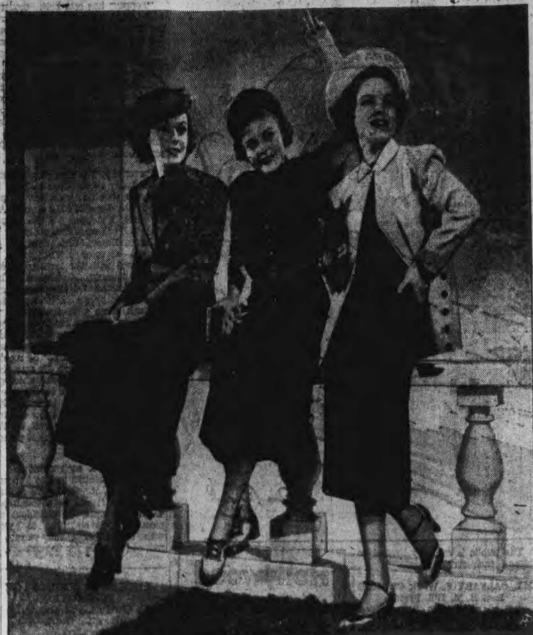
FASCINATING FOOTLIGHTS These three young ladies are up-to-the-season in their shoe notes. The wine kid pumps worn by the one at the left have smartly quilted insoles. White saddle-stitching trims the brown calf oxfords chosen by the companion at her left. The third member of the trio favors beige and black open-heeled bracelet-strapped slippers.