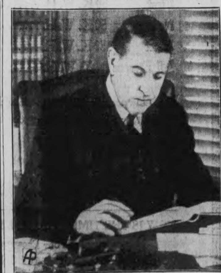
The Supreme Court upheld the Wagner Labor Relations Act by virtue of the deciding vote cast by Justice Owen J. Roberts. He delivered the decision, holding the act constitutional as applied to the Associated Press and to the Washington, Virginia and Maryland Coach company. Justice Roberts, who has held the balance of power in numerous other cases, is shown at his desk.