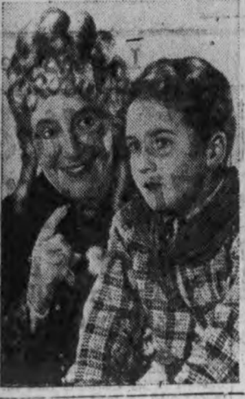
BOBBY BREEN and MAY ROBSON, who are starred in "Rainbow on the River," delightful drama of the Old South, and coming to the Pitt next Friday and Saturday.

BOBBY BREEN and MAY ROBSON , who are starred in "Rainbow on the River," delightful drama of the Old South, and coming to the Pitt next Friday and Saturday.