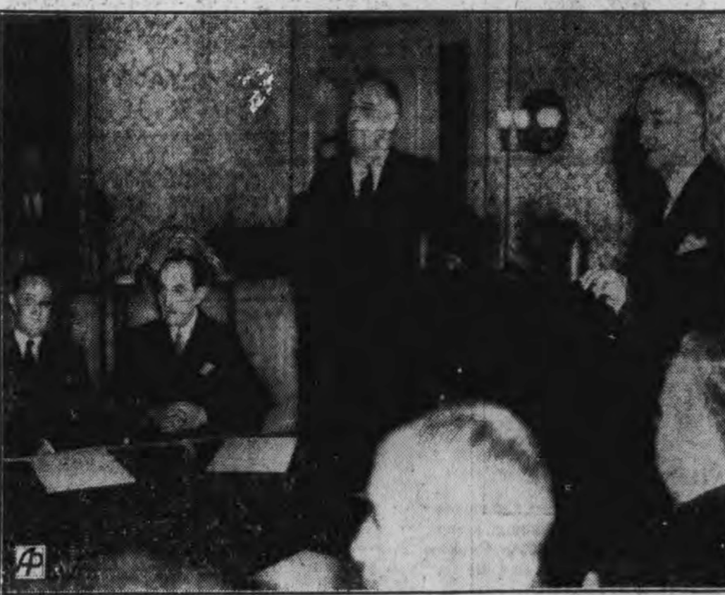
"We of the Americas have cause for rejoicing today, for we are enjoying the boon of peace," thus declared President Roosevelt in addressing the governing board of the Pan-American Union in Washington at a special Pan-American Day meeting.