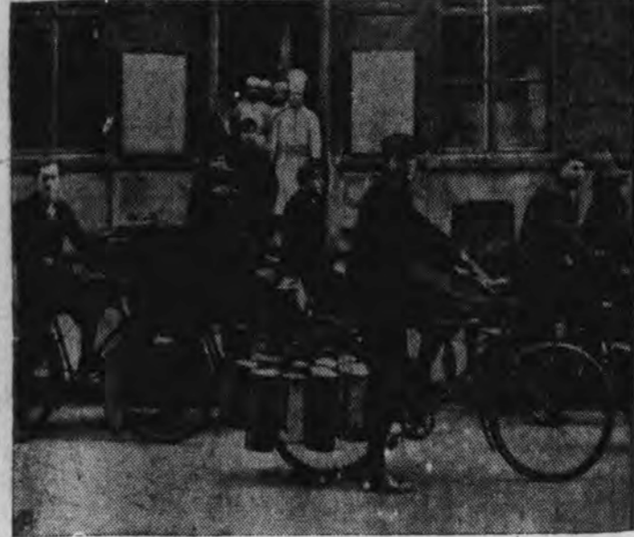
DELIVERED BY BIKE The bicycle brigade carries an estimated 250,000 of the inexpensive meals daily in deep-bottomed containers holding a hot course at every joint. (You can start at the top and eat down).