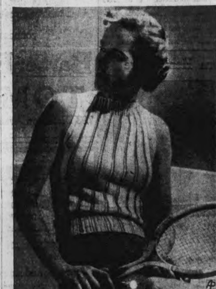
REVERSIBLE, SLEEVELESS SWEATER Here's a versatile sweater. It has colored stripes in front. But its back is just plain ribbing. The sweater may be worn either way under a suit, providing two vestees in one. It also may be worn minus the jacket.

An effective spring salad may be made by stuffing green peppers with a gelatin vegetable mixture and, when the gelatin becomes stiff, cutting the peppers into one-inch crossway slices topped by mayonnaise. Tiny cheese croquettes give added flavor.