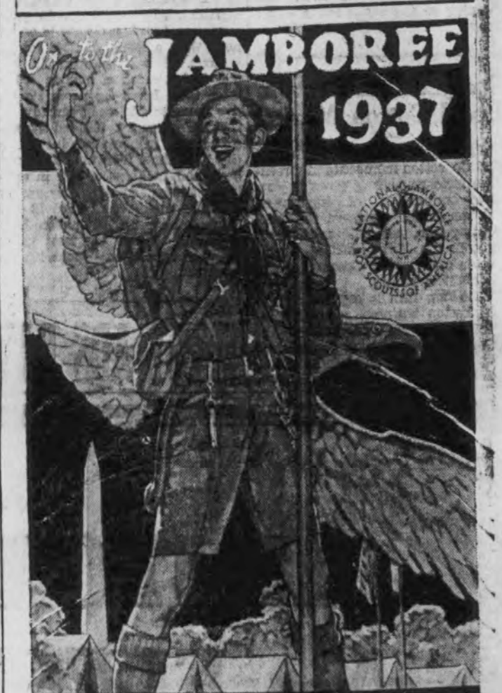
WASHINGTON D.C. JUNE 30 - JULY 9

THIS happy Scout portrayed on Norman Rockwell's painting for the official poster of the National Scout Jamboree typifies the spirit of friendship and adventure which will be the lot of 25,000 American boys who will camp with Scouts of other lands on 350 acres at Washington, D. C., loaned them by Congress for their Jamboree from June 30 to July 9. In the shadow of the Washington Monument a tented city will be the scene of the greatest demonstration of Scouting ever held in the new world. The national grand review and President Roosevelt's welcome will attract large throngs to the nation's capital. Other principal events include a Convocation at the Washington Monument on the evening of July 4 and a world brotherhood pageant to be held in conjunction with the closing campfire.