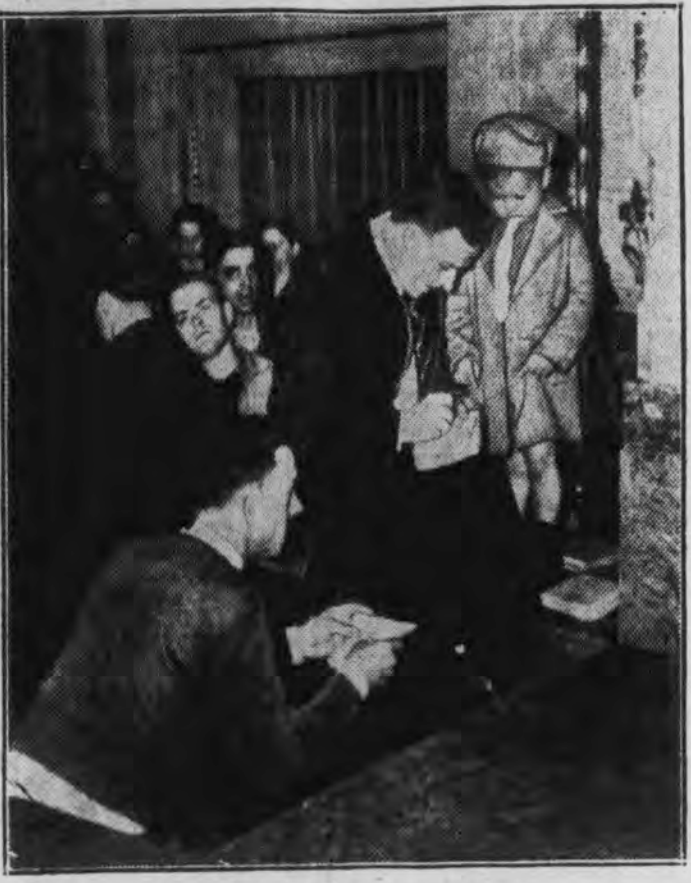
Employees of the Hershey Chocolate Corporation at Hershey, Pa., are shown signing pledges of loyalty to the company at a group meeting in the community center following bloody fighting in which farmers and non-strikers banded together to drive sit-downers from the plant.