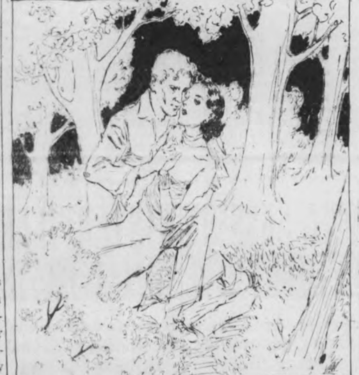
He caught her close to him. "Eve, you love me."

They Loved Each Other. At another time Eve would have been shaken by pity and grief and excitement, as Mattie was.