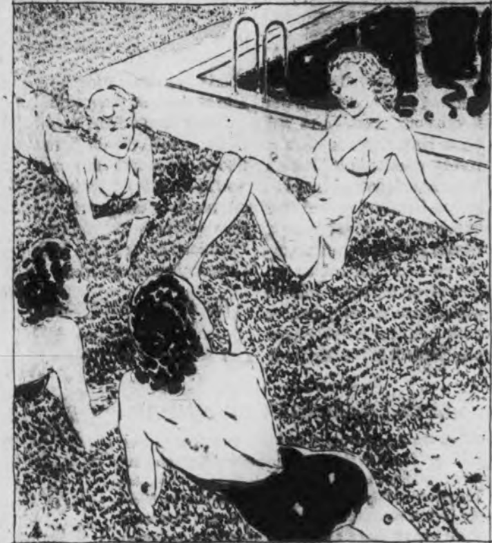
Eve was lying in the sun with George's guests—they were hers now, too.

She laughed aloud, with the incredible delight of it. She loved George. More than that, she was a part of him, of everything he was and said and did, as he was of her. That was why the Kay girl had thought they were married. In a thousand ways they were married, as