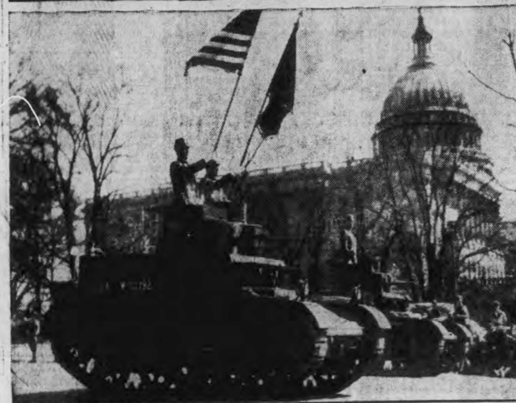
Down Washington's Constitution Avenue on Army Day marched crack troops of the nation to be reviewed by their commander-in-chief, President Roosevelt. Above, the president (right) is shown saluting as the colors went by. Standing beside the chief executive is Gen. Malin Craig, chief of staff of the Army, and at the extreme left is Admiral William D. Leahy, chief of naval operations. Below is shown a section of a light tank corps, which passed down the avenue with flags flying and sirens shrieking.