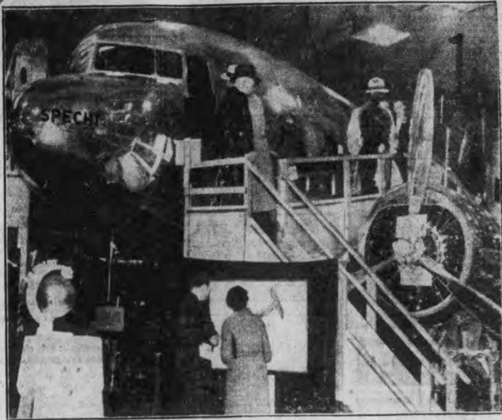
Flying searchers who sighted a wrecked airplane in the rough mountains of eastern Arizona believe it is the missing Douglas transport plane which vanished with eight persons aboard en route from Los Angeles to New York. It was being flown eastward for delivery to its purchaser, the Royal Dutch Air Line. The great ship is shown on exhibition in Los Angeles shortly before the flight was started.