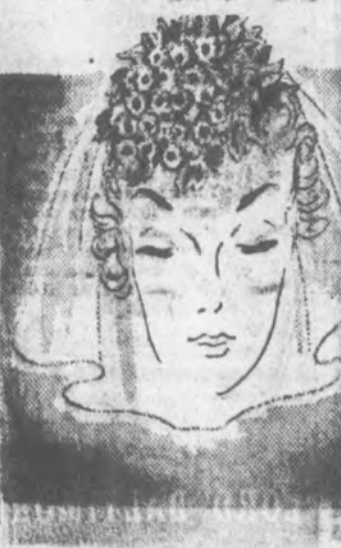
Atop Your Hat! 1.98 to 4.95