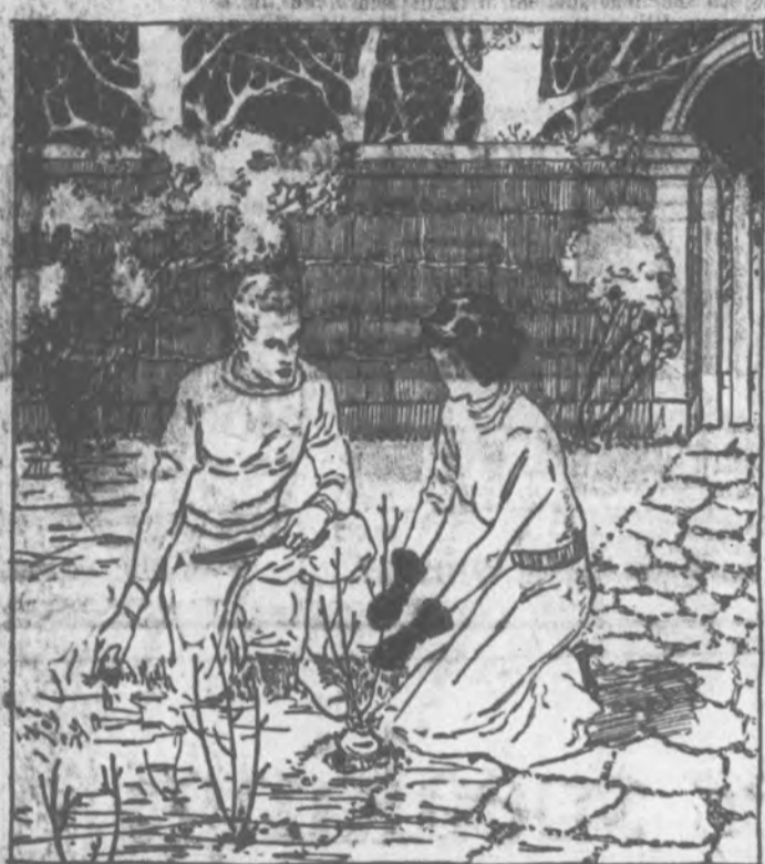
"I was a bit worried about whether you had enough money to carry them all summer."

She was in the dark dining room in a flash. "Denny?" "Eve darling!" Before he could say any more, she began to talk excitedly. "Denny, Denny darling, old Mr. Cleveland is in this very house as ever, playing chess with Peter, and isn't he an old sinner at all, he's a simple kind person and I'm going to