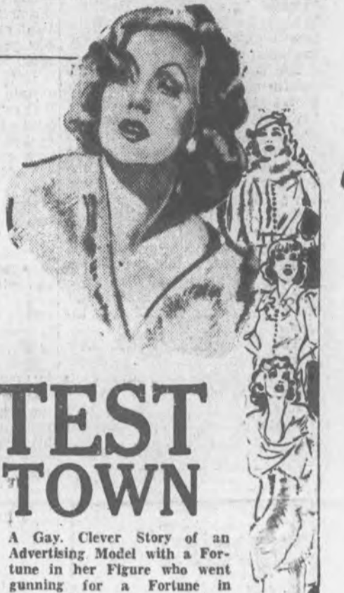
A Gay, Clever Story of an Advertising Model with a Fortune in her Figure who went gunning for a Fortune in Seven Figures!

Selected Units: POPEYE CARTOON "My Artistical Temperature" "TORTURE MONEY" Crime Doesn't Pay Subject — Pete Smith Novelty MAT. 25c PITT 35c