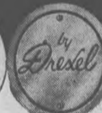
Makers of Bedroom and Dining Room Furniture