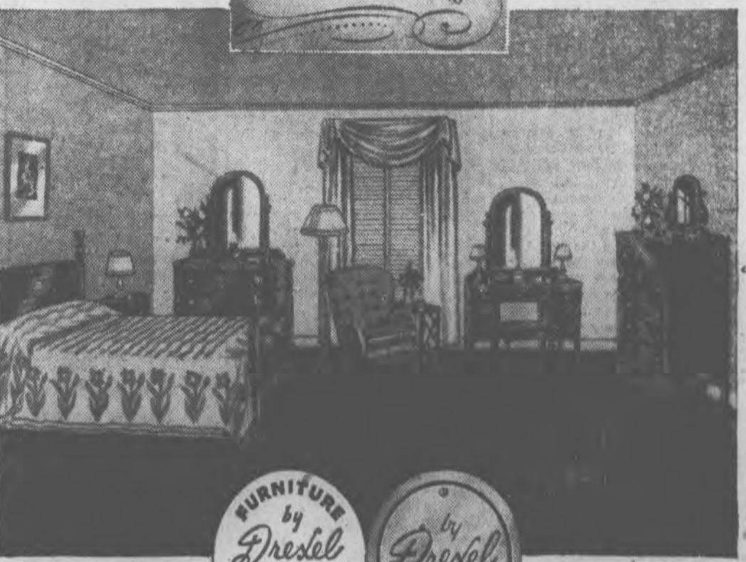
Furniture that Recreates the Genius of the Masters