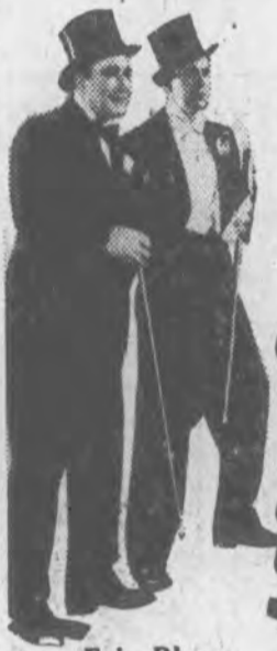
Eric Blore Helen Broderick