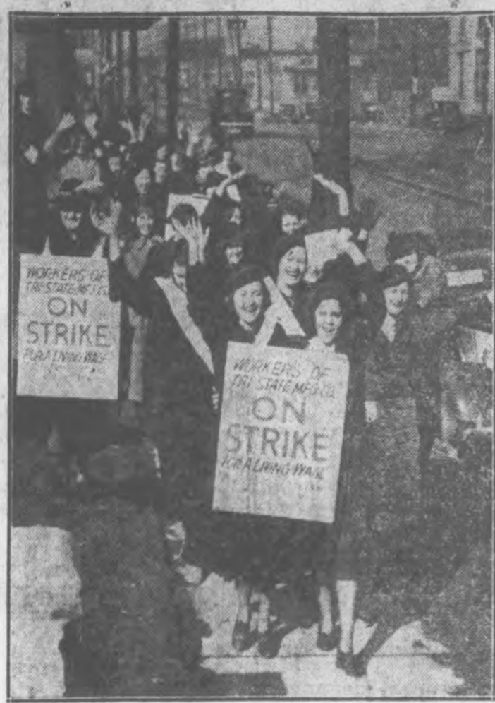
Singing and laughing, 50 girls carry banners demanding a "living wage" after going on strike at the Tri-State Dress Manufacturing Company in Memphis, Tenn.