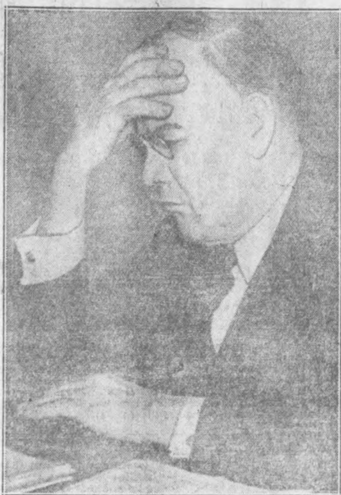
The many problems involved in his fight with John L. Lewis for allegiance of structural steel workers seem to weigh pretty heavy on William Green, president of the American Federation of Labor.