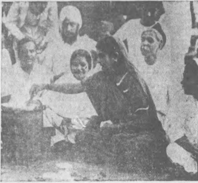
INDIA. Seven years ago Gandhi's followers sat down on the beach to make salt in defiance of British authorities, adopting a technique that since has spread around the world.