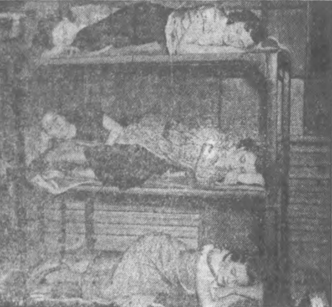
UNITED STATES. This winter the wave of sit-down strikes spread across America. In the wake of the big General Motors sit-down, girls in a Detroit seat-cover plant made the factory their temporary home.