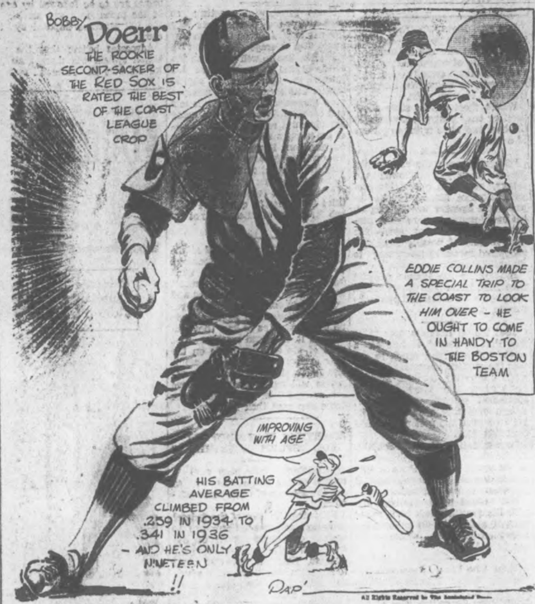
His batting average climbed from .259 in 1934 to .341 in 1936 - and he's only nineteen!!