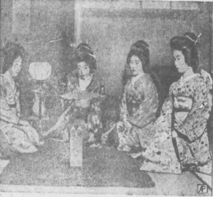
JAPAN. Back to the East, completing the curious cycle, the sit-down spread, when 900 per cent, gayly clad Geisha girls, such as these, sat down in an effort to win approval of a union.