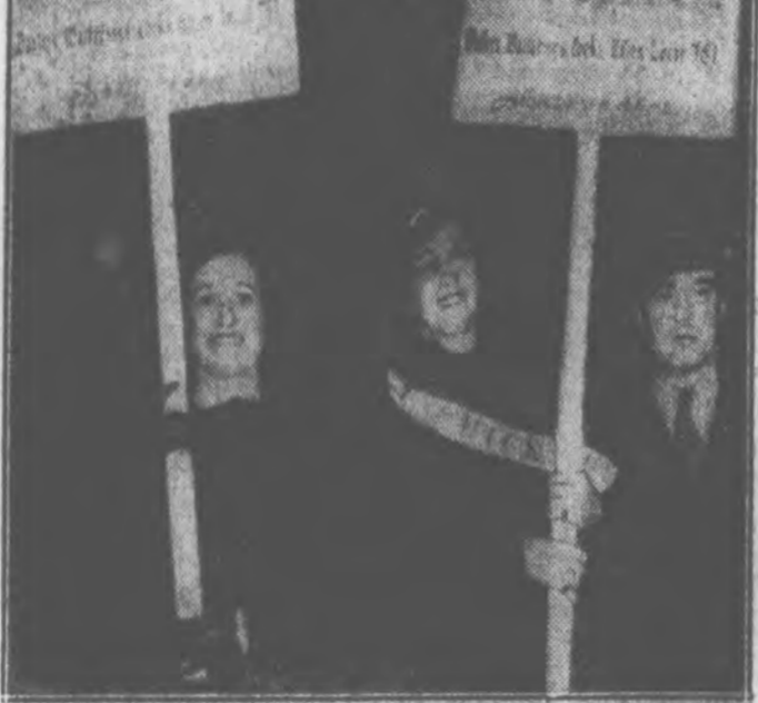
When John L. Lewis, generalissimo of strikes called by the Committee for Industrial Organization, arrived at the Willard hotel in Washington for the convention of labor's Non-Partisan League, he found these marchers and others picketing the hotel. Placards they carried proclaimed them as waiters, waitresses and cooks on strike. They are affiliated with the American Federation of Labor with which Lewis is at war.