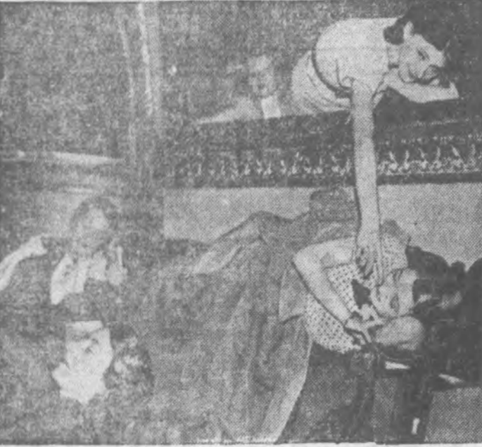
FRANCE. Last year France had a nation-wide sit-down, including even the Opera Comique staff. Girls lounged in boxes and dozed in plush covered chairs. Few sit-downers have had such comforts.