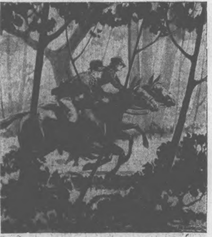
While their horses held an easy gallop, Anne and Bigelow did not speak.

that the police might discover the Vronski jewels in her possession." "She surely safeguarded herself against that risk," said he. "I'm hoping so."