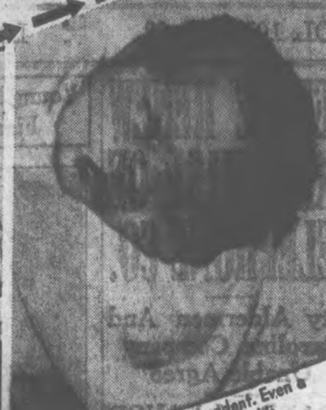
A BABY is just as dependent. Even a cry-baby comes in handy for this