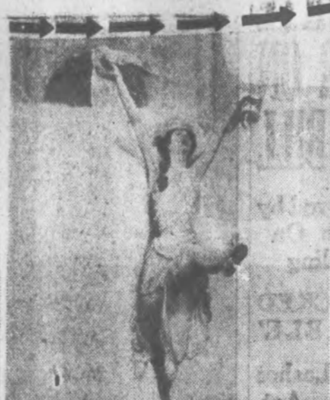
SPRING will be at hand. But March suggests that a lot of people will be . . .

THE IDEA:—Dance bands produce "swing music" by establishing a theme and then playing all around it. One thing leads to another in rapid, haywire succession. Since swing music is the rage, we thought you might get a kick out of "swing pictures," based on the same idea. We're not sure where we're going, but here goes!