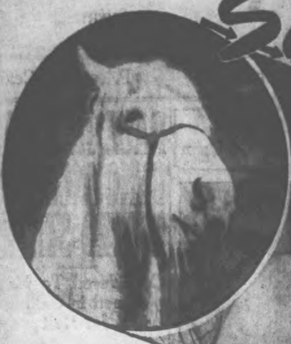
FIRST, you need a theme—something to "swing" from. Let's take a horse (above). Horses suggest Elsa Maxwell's barnyard party, high spot of New York's 1937 social season. Here is . . .