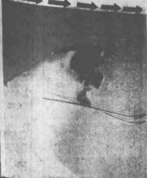
SNOW, which reminds us that soon the chill winds will fizzle away and . . .