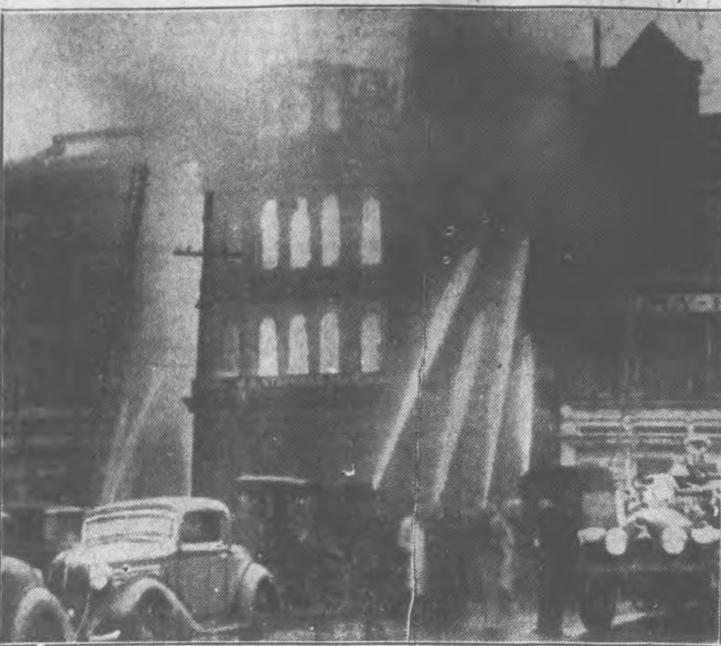
Three firemen perished and seven others were injured in flames that destroyed a building and damaged two adjoining structures on the public square in Nashville, Tenn. Fellow firemen are shown battling the raging blaze.