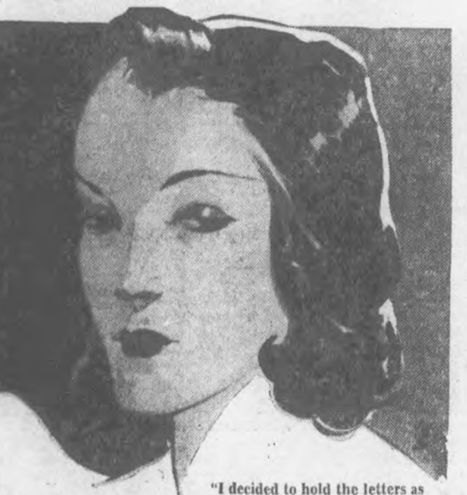
"I decided to hold the letters as a guarantee of my own safety," said Karsanokoff

Chapter 40 And The Letters? KARSANOKOFF relaxed among her cushions, looking from Bigelow to Austrelitz and back. The doctor nodded mechanically. He was lost in thought. Bigelow leaned forward to ask hesitatingly: "You examined the papers that you took from his apartment, of course?"