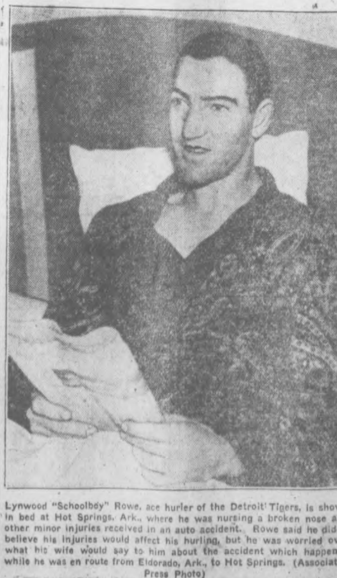
Lynwood "Schoolboy" Rowe, ace hurler of the Detroit Tigers, is shown in bed at Hot Springs, Ark., where he was nursing a broken nose and other minor injuries received in an auto accident.