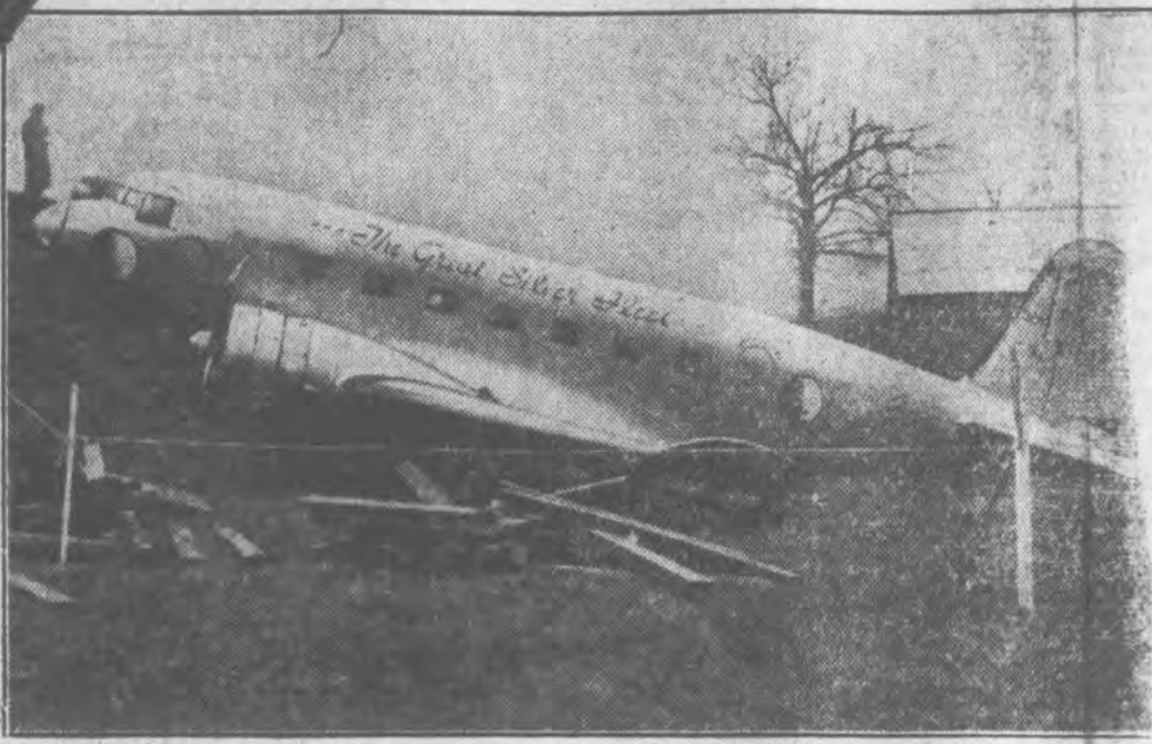
Five passengers and the crew of three escaped injury when an Eastern Air Lines transport plane crashed into an embankment in landing at Atlanta, Ga. The ship is shown piled up against the bank. It was en route from Chicago to Miami and was piloted by Capt. E. E. Ballough, of Jacksonville, Fla.