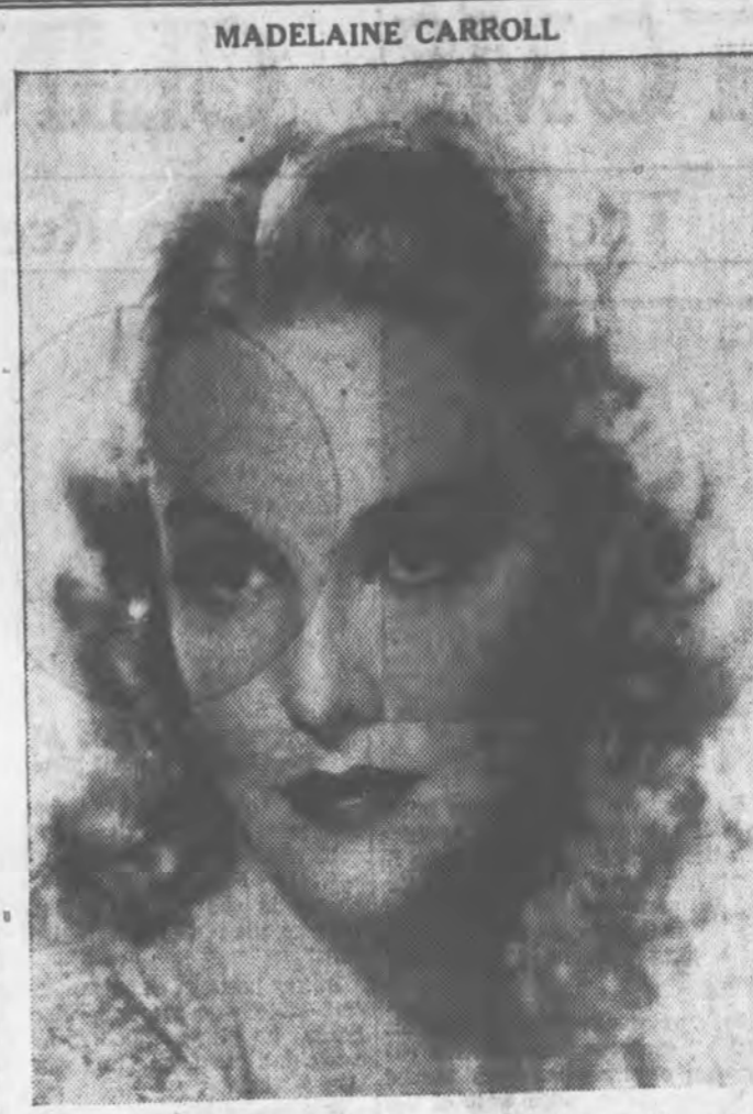
Lovely member of the impressive cast appearing in the moving picture, "Lloyds of London," opening at the Pitt Theatre Sunday.

At the State Next Week Sunday: "Rose Marie," starring Nelson Eddy and Jeannette MacDonald. Added "The Ski Parade," novelty. Monday and Tuesday: "All American Champ," with Stuart Erwin and Betty Furness. (Mature). Also musical "Camp Meeting," and Metro-tone News. Wednesday: "Kelly the Second," a comedy riot with Patsy Kelly, Charlie Chase and Pert Kelton. Also selected short subjects. Thursday: "Men in White," a tense, touching drama featuring Clark Gable and Myrna Loy. Also selected short subjects. Friday and Saturday: Gene Autrey, the singing cowboy in "Ride, Ranger Ride." Also "Cats in the Bag" cartoon and Chapter 13 of "Darkest Afrika."