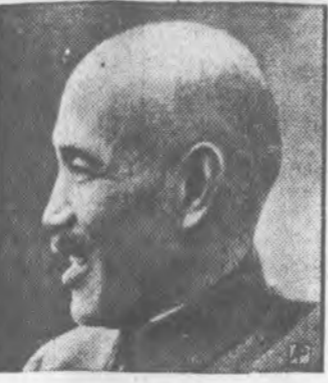
Kidnaped in China. War on Japan demanded as Chiang's ransom.