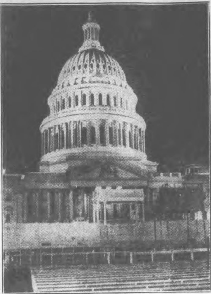
Floodlights, which make the great capitol dome a Washington landmark at night, also flood the inaugural stands on the east plaza where President Roosevelt will take the oath of office for his second term January 20. The nocturnal cameraman found the stands empty but they will be packed and jammed by thousands of spectators at the inauguration.