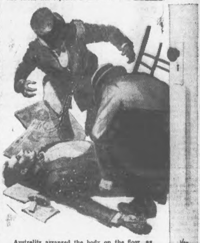
Austrelitz arranged the body on the floor, as though Vronski had been shot there.

His lips, shook his head slightly, warningly. The knock was repeated imperatively. "Hello?" came over the wire in Anne's sweet husky voice. "Did I wake you up?" "Yes," answered Bigelow frankly, "but I can think of no pleasanter way to be wakened."