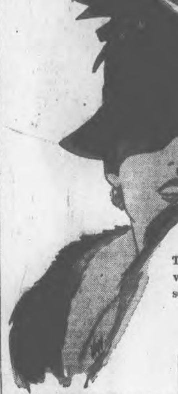
This girl with the low husky voice was the one he had seen in the hotel corridor the night before.

"No—I was going to say—your character and disposition! I'll have to see something of you before I shall feel competent to judge."