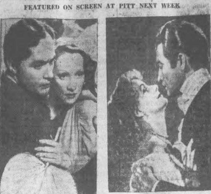
Charles Boyer and Mariene Dietrich in the fascinating romance, "The Garden of Allah," filmed entirely in technicolor, opens at the Pitt Wednesday.

Friday—Saturday—Bob Steele in a rattling, bustling story of the West, filled with hard-riding, quick shooting and romance, "Brand of Outlaw" plus "In My Gondola," color cartoon and Chapter 8 of "Darkest Africa."