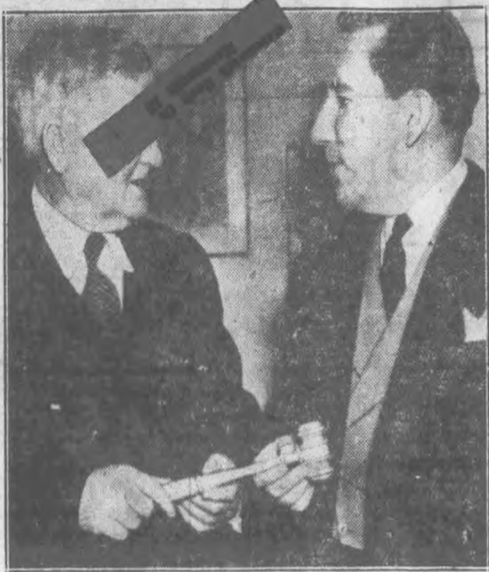
When Vice President Garner called the senate to order at the opening of the 75th Congress, he was the proud possessor of a brand new gavel from Florida. Senator Claude Pepper (right), Florida's new senator, is shown presenting it to the vice president.