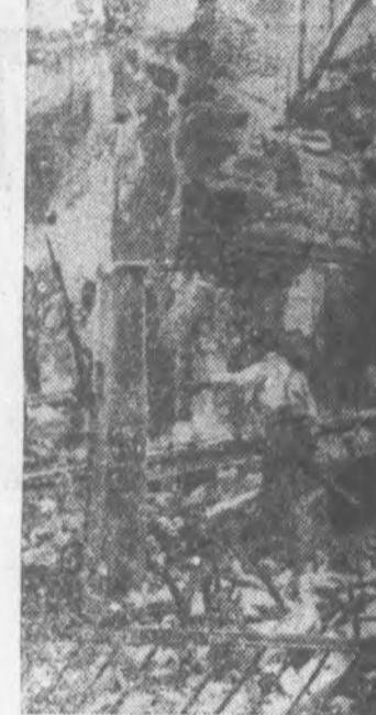
Fascists End Alcazar Siege and gingerly search the ruins.

"I have not sought, I do not seek, I repudiate," said Roosevelt, "the support of any advocate of communism or any other alienism which, by fair means or foul, would change our American democracy."