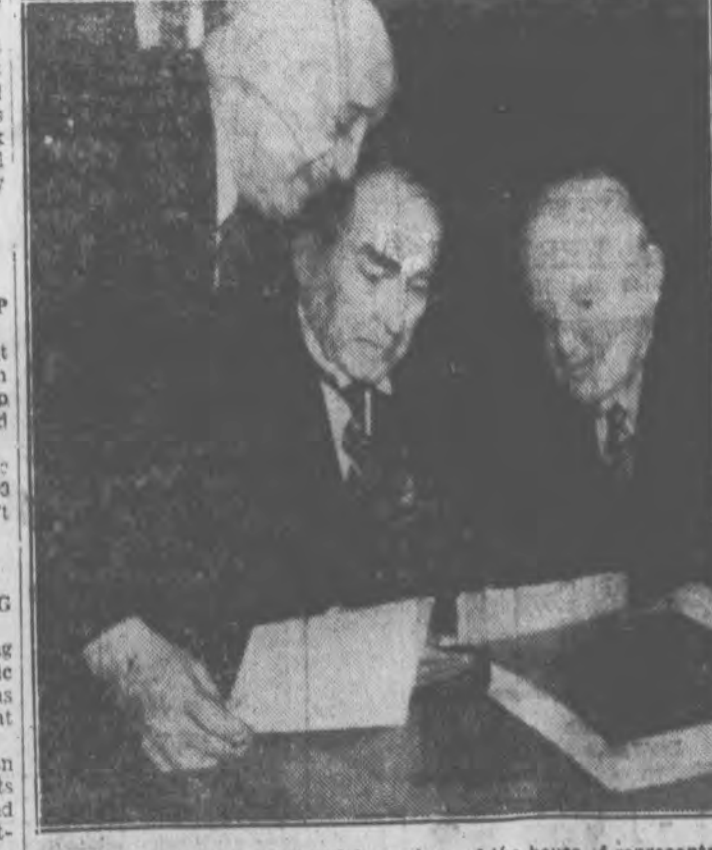
Here are the three most powerful members of the house of representatives conferring just before the opening of the 75th Congress. Left to right: Rep. Sam Rayburn of Texas, majority floor leader; Speaker William B. Bankhead of Alabama, and Rep. Bertrand H. Snell of New York, minority leader.