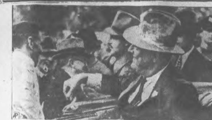
Roosevelt Gets Drenched and preaches of 'green pastures'

He continued with an appeal for the State Highway Patrol, all State agencies and the people to cooperate for greater highway safety. Pointing to what he termed the improvements brought about by NRA and the desirability for adequate regulation of working conditions and progress toward better wages, the Governor said that "reasonable and prudent regulations will aid materially in reducing unemployment and stabilizing business and furnishing the basis for continuing the fine relationship now existing between employers and employees in this State."