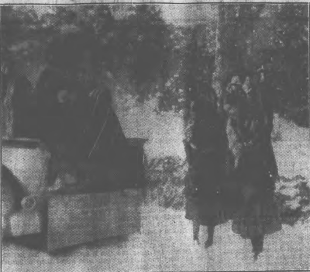
Snow-bound nearly a week in the Zuni mountains near Gallup, New Mexico, after a severe blizzard swept that territory, 300 Navajo Indians were rescued by a searching party that dug through deep drifts for two days with the help of a snow plow. One of the rescue trucks is shown taking a group of the Indians to safety.

breakfast. Jolson was wolfing coffee and flannel cake when a servant came in and inquired after the number of a local physician.