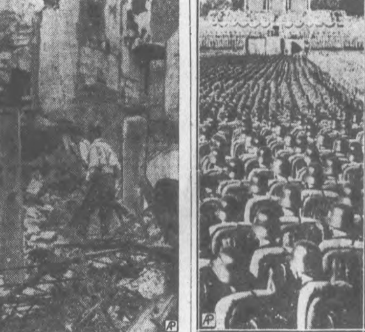
Hitler Covets Russia and an army hangs on his words.