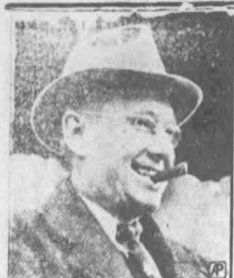
Landon Chews a Stogie, and assails New Deal