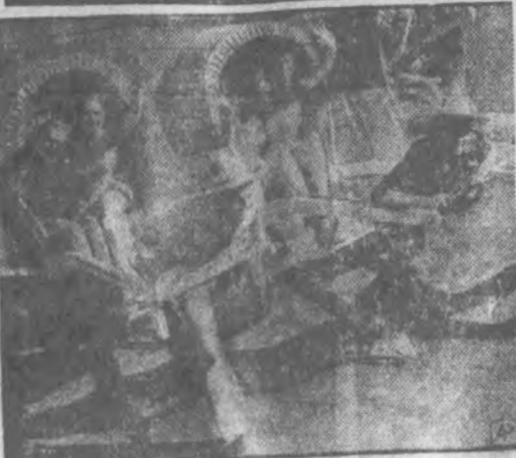
Young Folks Frolicked—Like these at Texas exposition