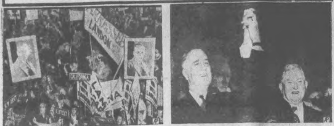
Republicans Go For Landon Democrats Re-Name F.D.R. & Co.

By VOLTA TORREY AP Feature Service Writer Jubilantly the Grand Old Party trumpeted against the alphabet men in June, 1936.