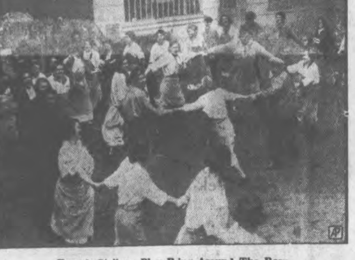
French Strikers Play Ring Around The Rosy