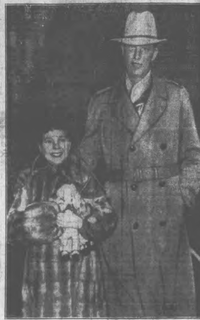
And everywhere that Jane goes, the bodyguard is sure to go! Because she is the object of a $50,000 kidnap threat, Jane Withers, the Atlanta, Ga., child star of the movies, is accompanied everywhere by a husky bodyguard, who even sleeps in the room next to hers. They are shown here together in Boston where she is making a personal appearance.