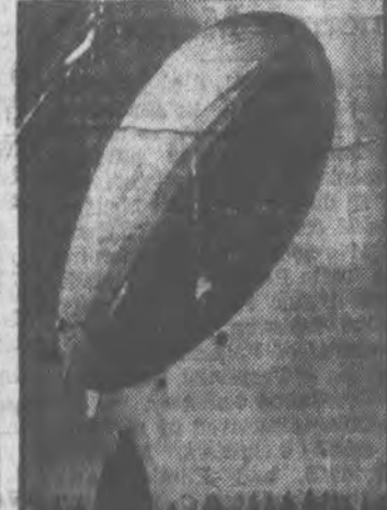
THE HINDENBURG ARRIVES after crossing the Atlantic in record time