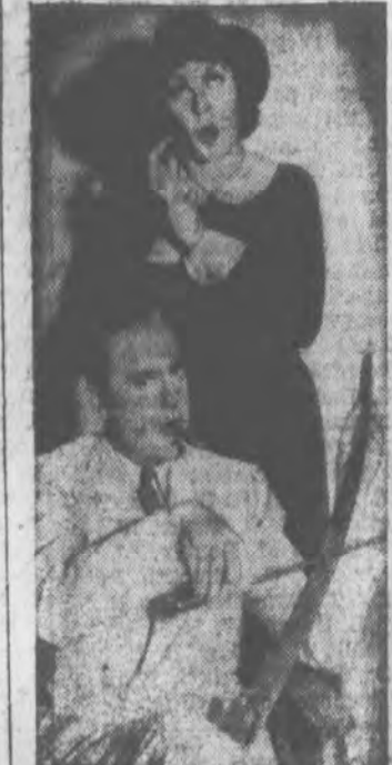
Martha Raye and Jack Benny, two of the funmakers in "College Holiday," at the Pitt Saturday-Sunday.