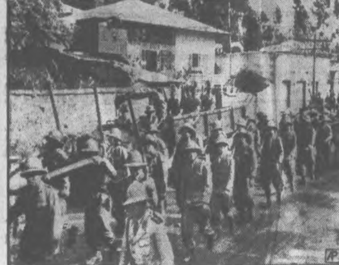
LA GUERRA E FINITA! and Italian soldiers march into Addis Ababa

"Replacement of signs is frequently necessary, not so much because they naturally become obsolete as because of vandalism. An undisturbed sign should last five or more years without replacement. It is probable that over half of the signs replaced are because of vandalism.