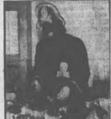
BLACK LEGION KILLS MAN A detective poses in a role of the weird order