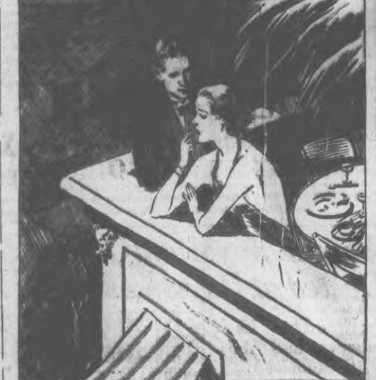
"You're a pretty rare sort of a girl, you know—fun to be with and good to look at," Bob told Sally.

"Goodnight, my dear," said Mr. Warren. "You look very much like your own mother tonight in that white dress."