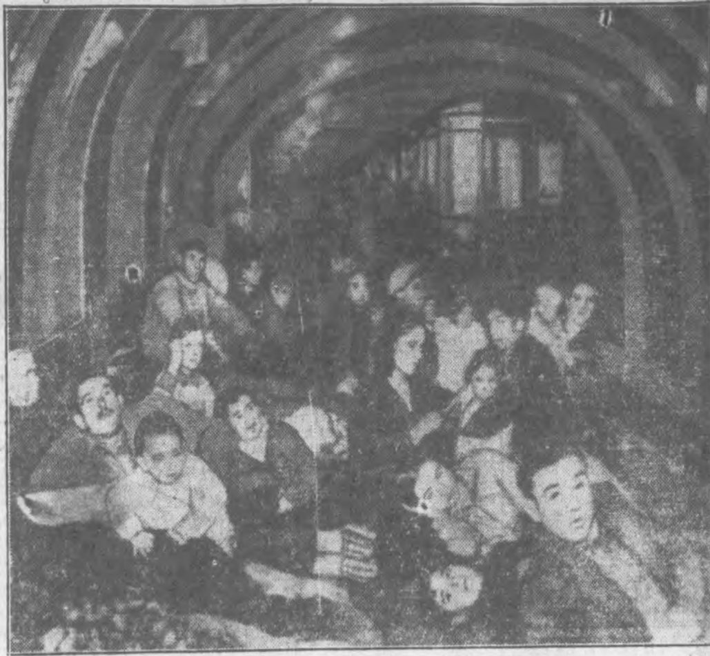
Terrified by the increasing rain of artillery shells and airplane bombs, citizens of Madrid are shown packed into subways in quest of refuge. Fascist aviators attacked the city with renewed fury with the lifting of rainy, foggy weather. This picture was sent to the United States by radio.