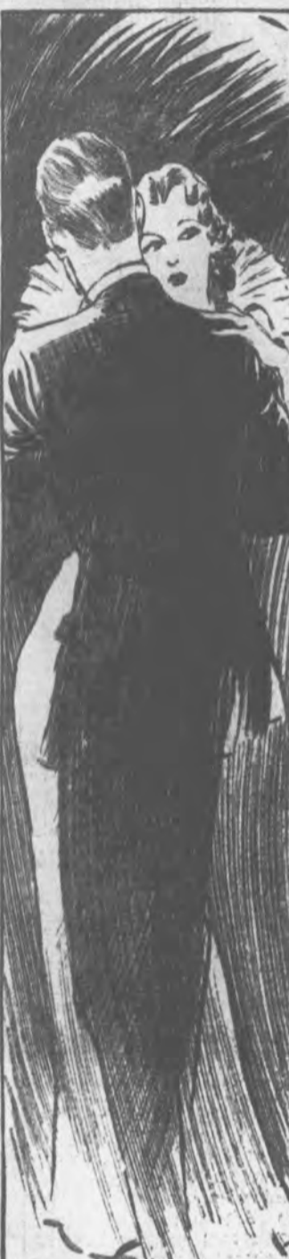
They danced, for the last time, Sally told herself.

They danced, for the last time, Sally told herself. She thought she had never loved him so much. All her anger was gone, her anger against Tip and Terry. She had only pity for herself. At every turn, he hurt her with his talk of Tip, his gladness at his release. It was better that he should not know the truth about how she felt. If no one knew, then at least she could save her pride, whatever comfort there was in that.