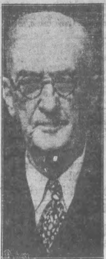
Suffering from a hypostatic condition of the lungs and heart trouble, George Ade (above), the 70-year-old Indiana humorist and author, was reported gravely ill at his winter home in Miami Beach, Fla.