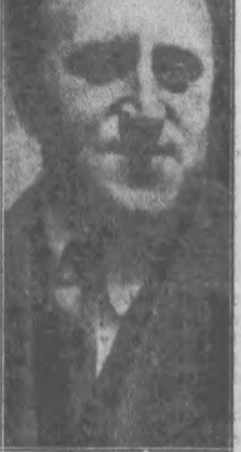
Karl von Ossietzky (above), the celebrated pacifist who has just been released after three years' confinement in a German concentration camp, is reported to have been voted the Nobel peace prize. It was indicated, however, he would refuse it as a consequence of the Nazi view that acceptance would be an offense to the Third Reich.

Farm leaders meeting here wanted AAA and its fairer benefits, to replace the present soil conservation