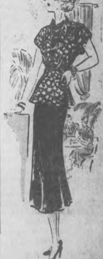
Style 770—Seen at New York's smartest restaurants—the most exciting news in all the PETER PAN fashion bulletins today is the importance of metallics—fabrics worn by the smartest women everywhere when she'd rather be lovely than prudent. Sizes: 12 to 20.