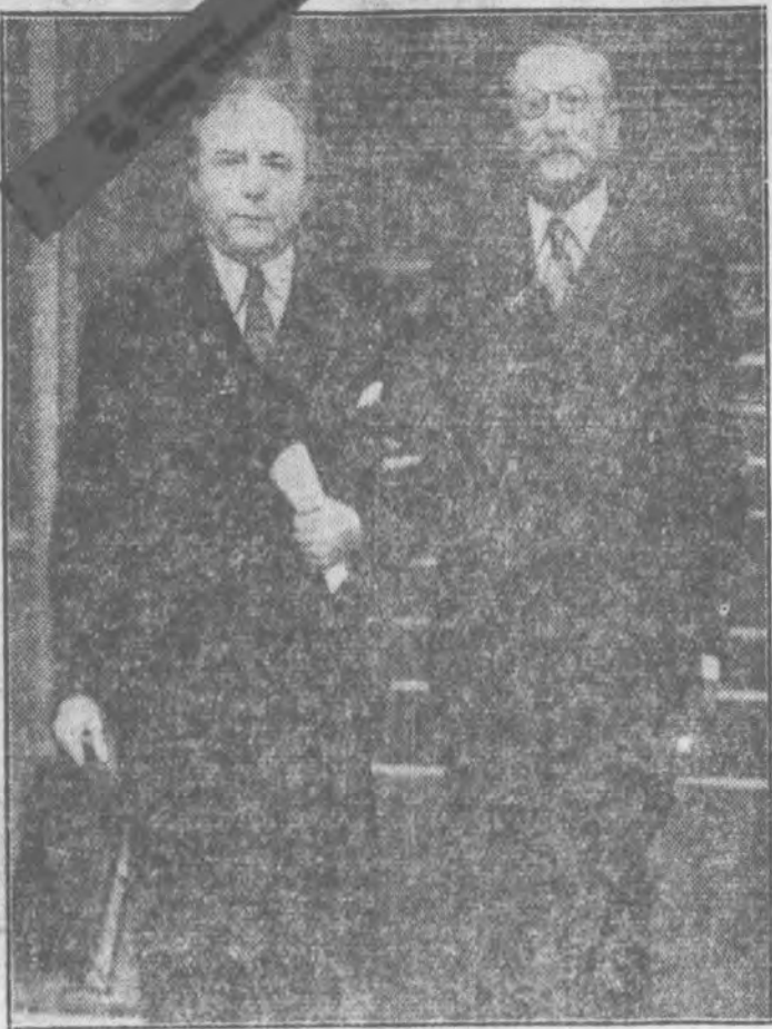
Grave political problems for the French government were created by the death of Roger Salengro, minister of the interior in the cabinet of Premier Leon Blum, whose body was found in a gas-filled room at Lille. He left a note saying he killed himself because of attacks rightists made upon him. Salengro (left) and Blum are shown together at a recent conference.