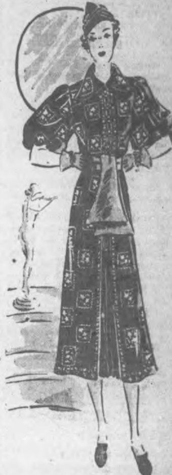
Style 796—With particular genius PETER PAN'S designer gives you three of the most striking fashions thoughts. Silk jersey is the "Tops" in chic—peasant influence make all embroideries important—and every smart young thing is gracing herself in a suede cashmere. Colors: black and navy. Sizes: 12 to 20.

TOQUES are TOPS NOW! Saucy or Pert... they're Perfect Partners for Princess Fashions.