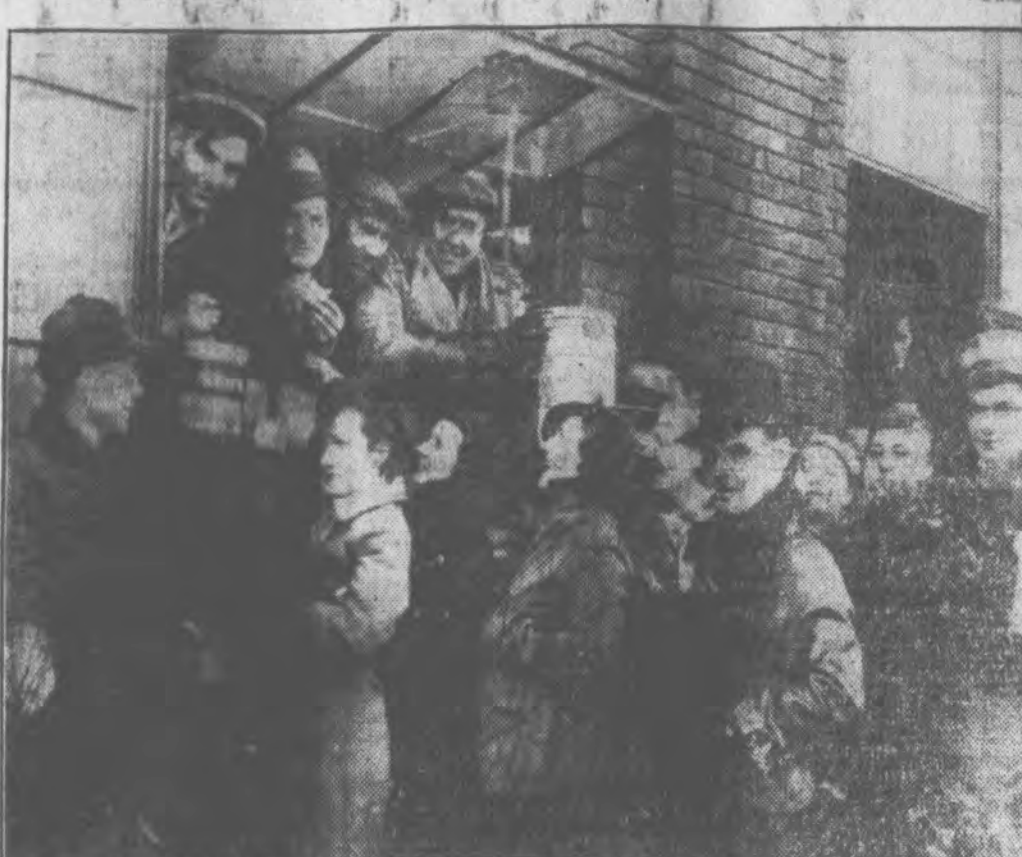
Defiant of the Bendix Products corporation's orders to close its huge factory at South Bend, Ind., workers estimated to number somewhere between 600 and 1,500 remained inside the plant and calmly continuing their "sit-down" strike. A group of the strikers is shown receiving food through a window from their wives and sympathizers. The factory manufactures vital parts for most of the automobiles and airplanes made in the United States.

Advocates of the county liquor stores plan and who want it continued and expanded by the forthcoming general assembly, maintain that most of the counties in the eastern part of the state adjoining those which now have legal liquor stores, also want liquor, but want it under the county control system instead of under a state system. They believe that most of these counties will line up with the present "wet" counties in opposition to any state-wide liquor control program and in favor of county control. The counties which prefer county control to state control of liquor stores are also expected to receive very strong and valuable support from two other sources—the hotel men of North Carolina and the liquor manufacturers, according to reports already going the rounds here. The hotel men are believed to be in favor of county control for two reasons, as follows: 1. More salesmen are required to sell liquor to 50 or 60 county liquor boards, than are required to sell to a single purchasing board or commission here in Raleigh, and these liquor salesmen are conceded to be among the most lucrative guests