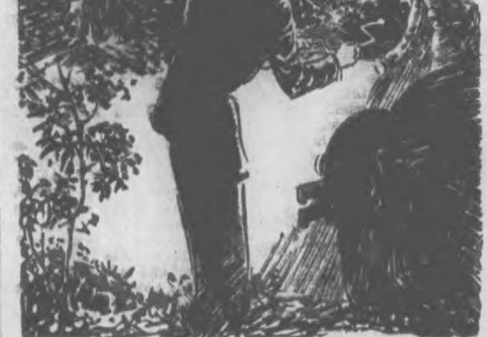
They saw a flashlight turn off, a girl disappear.

"Yep," Duke Adams worked at his fire, keeping his face turned from Sally. "Couple of passengers wanted