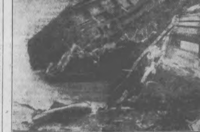
Two members of the crew were killed and a score of persons were injured in the plunge of a Big Four passenger train over a 40-foot embankment near Indianapolis, Ind. The locomotive and two cars remained on the rails but 10 other cars leaped from a bridge over a small creek and tumbled down the banks and piled up in the bed of the stream. A section of the wreckage is shown above.