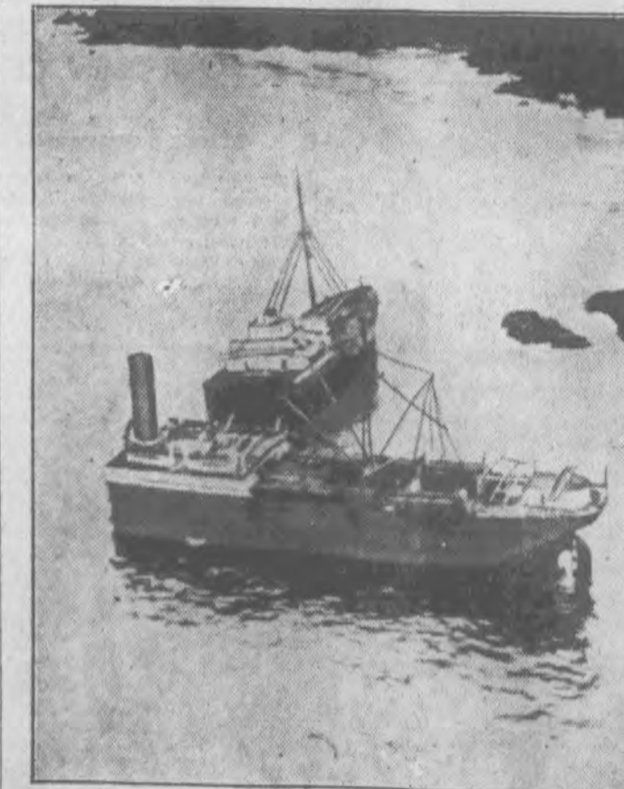
Here's how the American steamship Bessemer City appeared after she ran aground on the rugged coast of Cornwall, England, and was sliced in two, the halves swinging at right angles to each other. The crew of 33 and the ship's cat were saved by St. Ives surfmen.