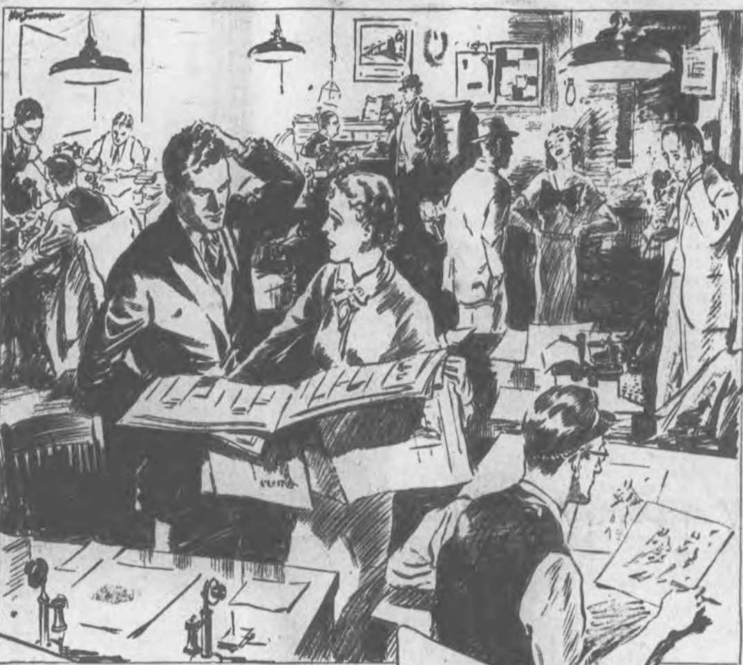
Sally was taking over the society page at the Warrenton Courier.

The odor of frying bacon made Sally jump out of bed with guilty haste, for that meant her stepmother.