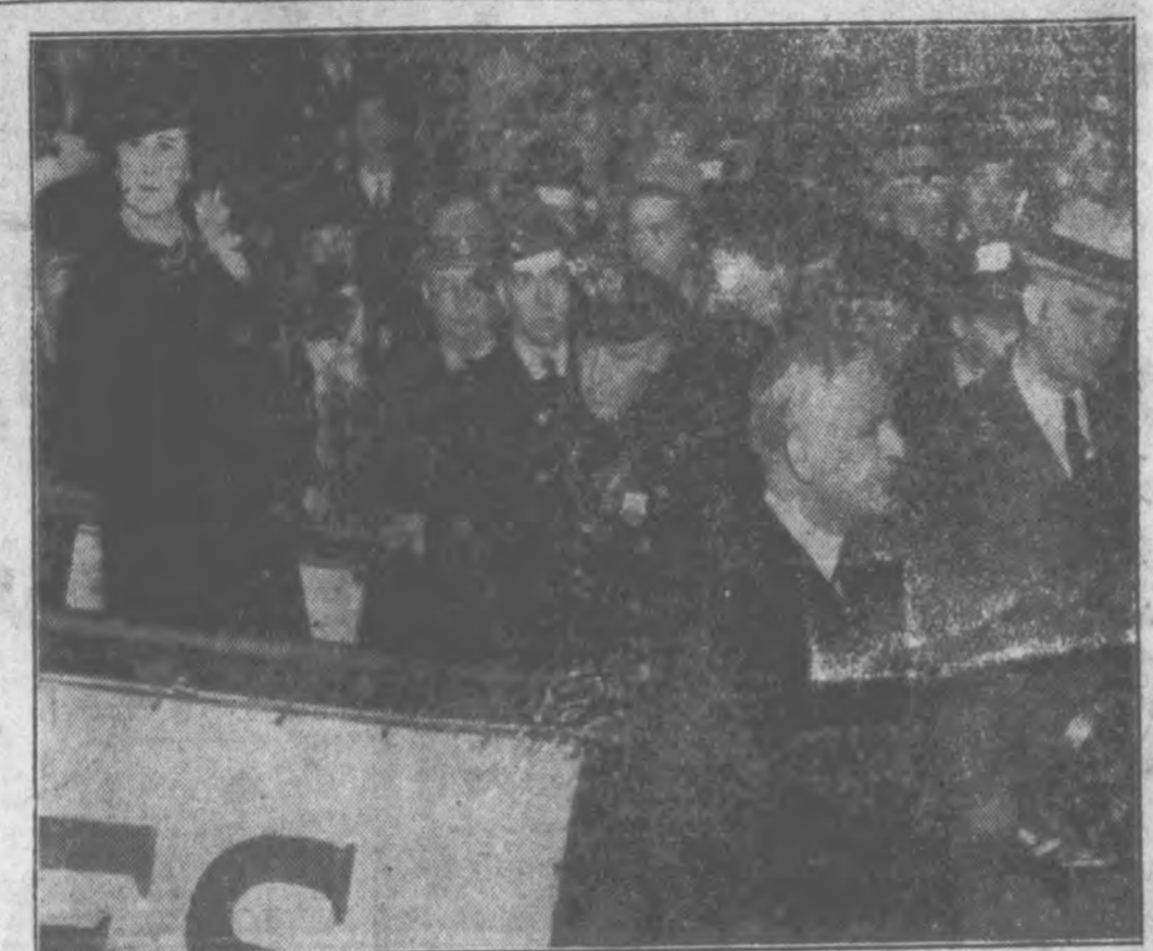
Many hours after they had expected to be on the high seas en route to the Inter-American peace conference at Buenos Aires, Secretary of State Hull and other United States delegates were "becalmed" aboard their ship, the Munson liner American Legion, in lower New York harbor as a consequence of the maritime strike which prevented the vessel from mustering a full crew. Secretary Hull (right foreground) and his wife are shown boarding ship which was picketed by strikers along the dock.