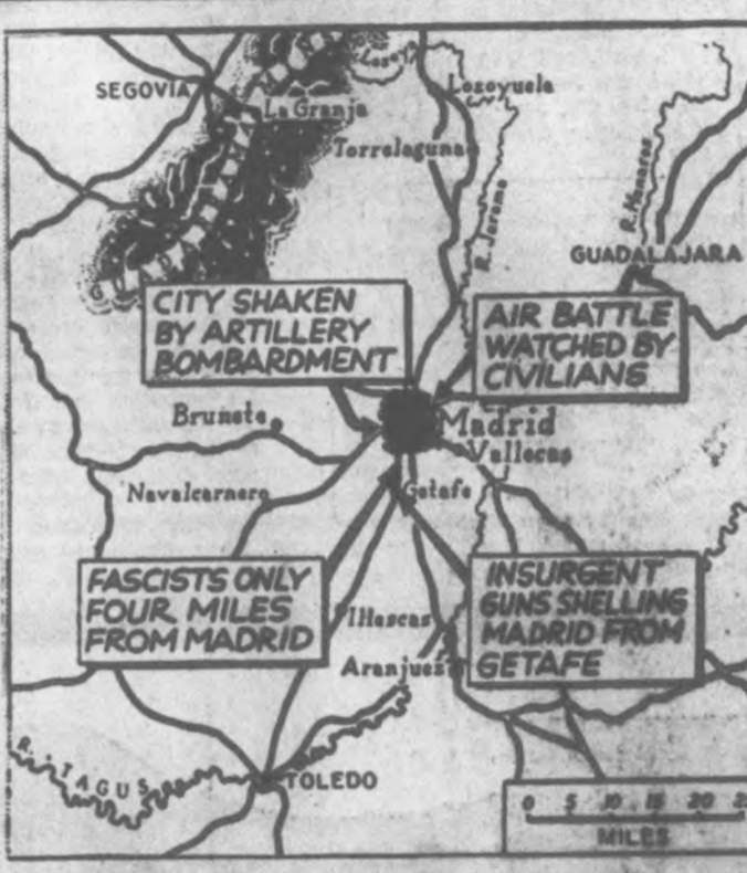
Panic-stricken residents of Madrid were brought face to face with Spain's terrible civil war when insurgents advanced to the very gates of the city and opened a heavy artillery bombardment. The above may illustrate the strategic stages in the "decisive battle" for possession of Madrid.