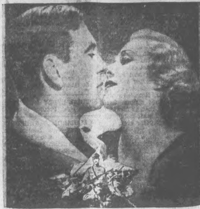
Madeline Carroll cast as an adventures is paid to lure Gary Cooper to his doom in 'The General Died at Dawn' opening at the Pitt Monday, but her heart proves weaker than her loyalty to the cause of a scheming Chinese War-Lord.