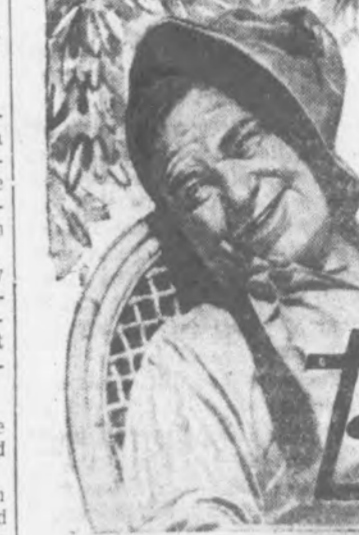
Don't take my word for it... but I think "Old Hutch" will make you laugh and cry and holler just like "Ah Wilderness" and "Min and Bill"!

WATCH REPAIRING— JEWELRY REPAIRING Engraving—Reasonable Price LAUTARES'