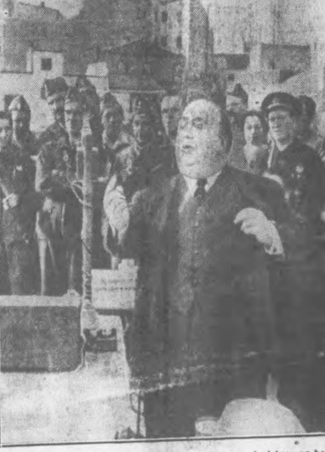
Mayor Pedro Rico of Madrid is shown in this unusual picture as he exhorted government troops departing from the battle lines to "expend every effort" in driving insurgents from the vicinity. While he spoke, the insurgents were pushing within 15 miles of Madrid.