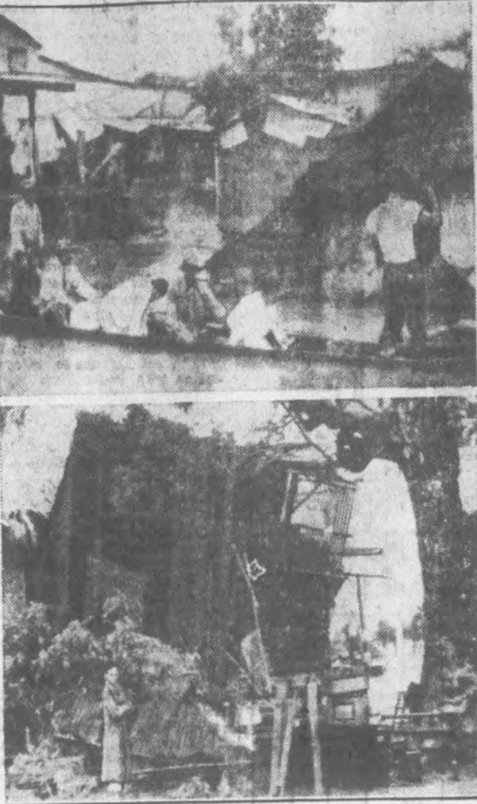
In the wake of the terrific typhoon that brought death to about 500 persons and left a thousand or more missing in the Philippines, survivors are seen (top) rowing a boat through the wreckage in search of victims. Below, is some of the wreckage of homes piled up by wind and swirling flood water near the town of Cabanatuan. These pictures were brought to the United States by Pan-American Airway's Hawaiian Clipper.