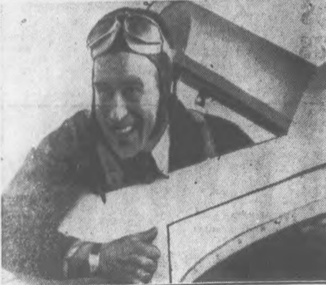
Capt. Frank Hawks, famous speed pilot, is shown (below) testing his mysterious plane, "Time Files," which he believes is capable of making more than "375 miles an hour wide open." The ship, shown (top) in flight, was constructed under greatest secrecy.

most careful study. Refugees were pouring into France in large numbers through Catalonia, one of the last avenues of escape for government supporters from the fascists encirclement of Madrid.