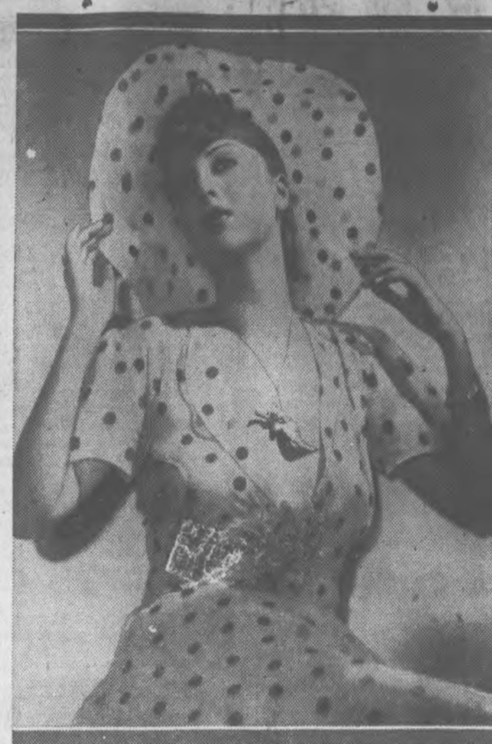
Gypsy Rose Lee (above), whose finesse in disrobing on the burlesque stage won her fame and a role in the Follies, aspires to do really serious drama. There is little future, she says, to the art of strip-tease dancing.

tary Morgenthau has pointed out, the agreement is on a 24 hour basis. Some of New York's shrewdest financial observers prophesy a slow but steady competitive depreciation of currencies. They figure that one or more of the three nations involved will inevitably try to get an edge on the others by co-opting its money and that the others will have to respond in kind. When Secretary Morgenthau announced that it would not mean further dollar devaluation if the Treasury were to pay more than the currently prescribed price of $35.00 an ounce for gold, he was subtly preparing for warfare along these lines. He needs to be free to use this gold weapon without rousing a tremendous howl about the administration wrecking the dollar again.