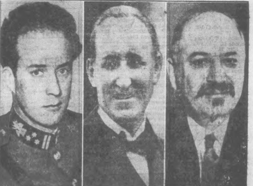
In the midst of Europe's war and rumors of wars, these three men suddenly have been cast into the center of the maelstrom. King Leopold of Belgium (left) shocked the continent by his unexpected declaration for strict neutrality, presaging the scrapping of Belgium's mutual assistance treaties with France and other nations. Meanwhile Ivan M. Maisky (right), Soviet ambassador to London, was unrelenting in his demand that Lord Plymouth (center), secretary of Europe's committee on non-intervention in the Spanish civil war, call a meeting of the powers to act on the Russian plan for blocking all shipments of arms to the Spanish Fascists.

you been cuttin'—the last two cords with the handle!"