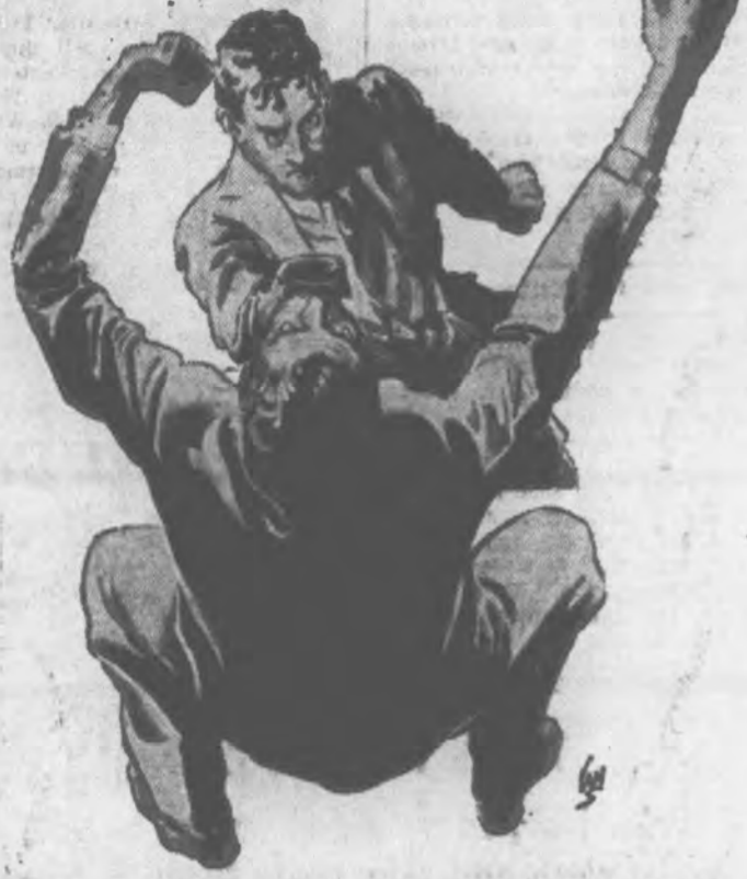
The punch knocked Flynn across the room.

Just as he hit at the other man of the invading party, the man moved; the blow which had been meant for his