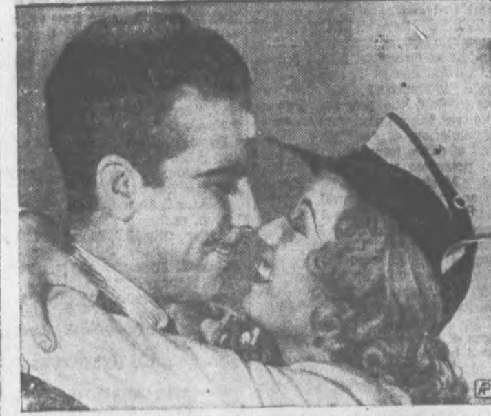
"IT'S BEEN SO LONG:" By Dick Powell and Jeon Blondell—30 feet.