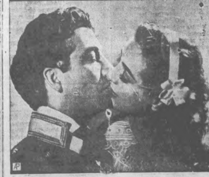
"SEE YOU IN THE MORNING:" By Robert Taylor (at it again!) and Joan Crawford—16 feet if they are engaged; 26 if they are not.