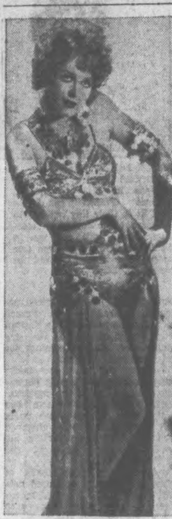
ORIGINAL 'IT' GIRL

"... 'It'—that rare gift of the Gods! ... To have 'it', the fortunate possessor must have that strange magnetism which attracts both sexes. He or she must be entirely unconscious and full of self-confidence, indifferent to the effect he or she is producing, and unimpaired by others. There must be physical attraction but beauty is unnecessary. Conceit or self-consciousness destroys 'it' immediately. In the animal world 'it' demonstrates in tigers and cats—both animals being fascinating and mysterious, and quite unobtainable."