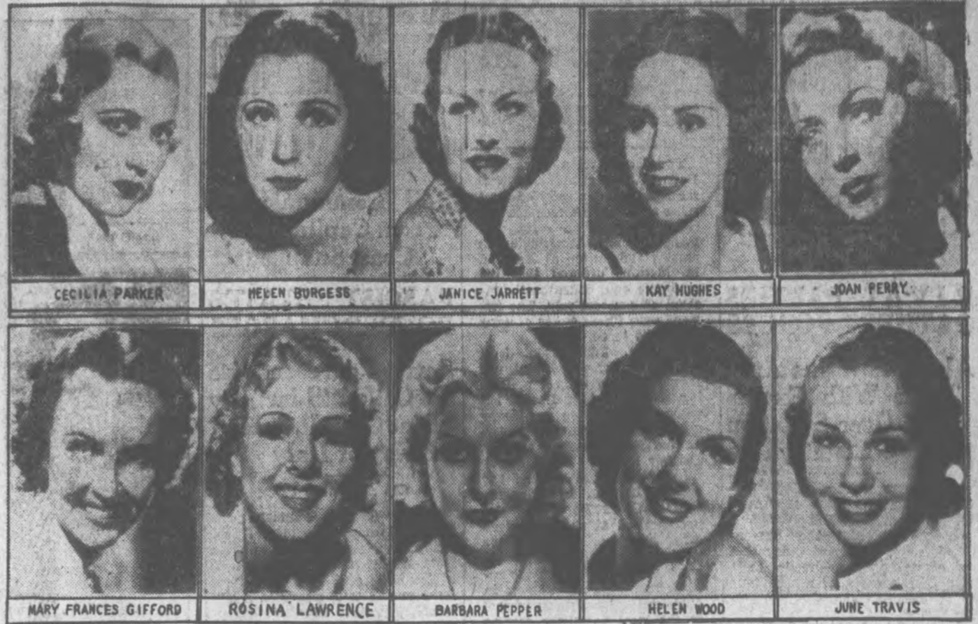
In the opinion of newspaper photographers who know the girls of Hollywood, blondes will dominate the moving pictures of the near future. In the list of 10 younger actresses chosen by the photographers as most likely to succeed on the screen—which means reaching stardom—seven are blondes. The favored ten are shown above.