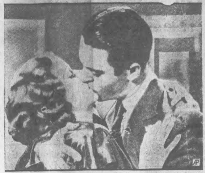
"BOY MEETS GIRL:" By Jean Harlow and Chester Morris—85 feet.