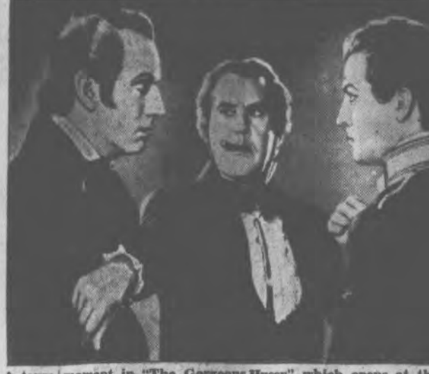
A tense moment in "The Gorgeous Hussy" which opens at the Pitt on Monday. Robert Taylor as a young naval officer prelates a quarrel with Melvyn Douglas, in role of Senator. Both are rivals for hand of Joan Crawford in this historical romance.