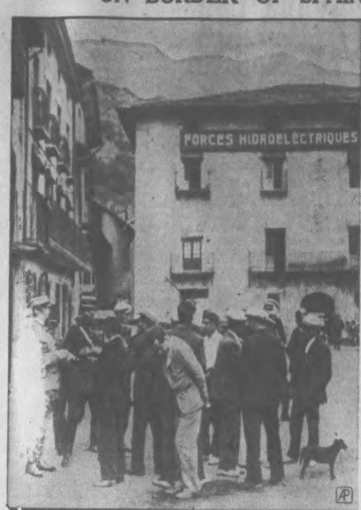
FRANCE IRKED THEM Andorrans came to public squares in 1933 to protest against French gendarmes sent in to their tiny republic to preserve order during an elec- tion. Now, with civil war in Spain uncomfortably close (see map), the French would be welcome.