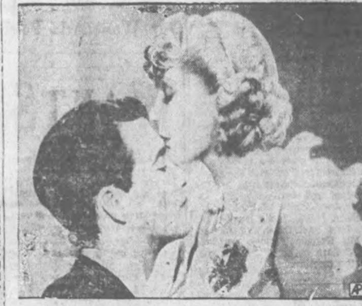
"THANK YOU FOR THE JEWELS:" By Robert Taylor and June Knight—20 feet.