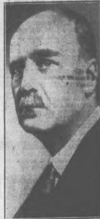
Bent on learning what effect changes in the temperature of the blood have on the mind, Sir Joseph Barcroft (above), famous English physiologist, deliberately froze himself to the borderline of insanity and found himself unable to concentrate, converse intelligently or read a newspaper without great effort. He described his reactions in an address at Yale university.