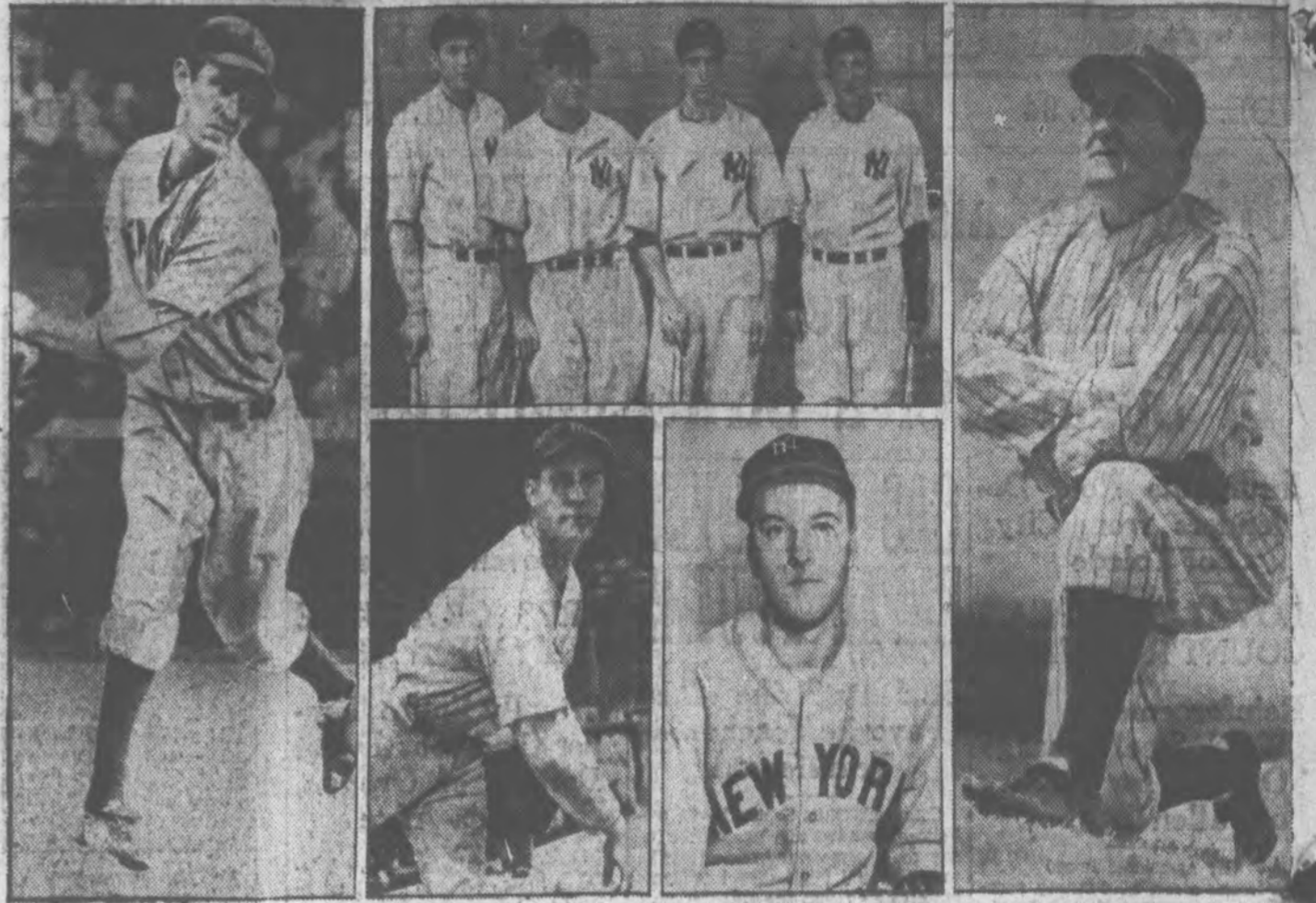
With steam up, the New York Yankees' "powerhouse" was ready for World Series battle—a "subway" series with the Giants across the Harlem River. The likely choice of Manager Joe McCarthy (right) for a starting pitcher to oppose Hubbell rested between Vernon ("Goofy") Gomez (left), Charlie ("The Red") Ruffing (lower left center), and Monte Pearson (lower right center). Regardless of starting pitchers, the opposition has always to worry over the famous "Murderers' Row"—(left to right, top) Bill Dickey, Lou Gehrig, Joe DiMaggio and Tony Lazzeri.

non-fatal; Rowan, 1 fatal, 6 non-fatal; Vance, 2 fatal, 9 non-fatal; Wayne, 5 non-fatal; Wilson, 1 fatal, 8 non-fatal.