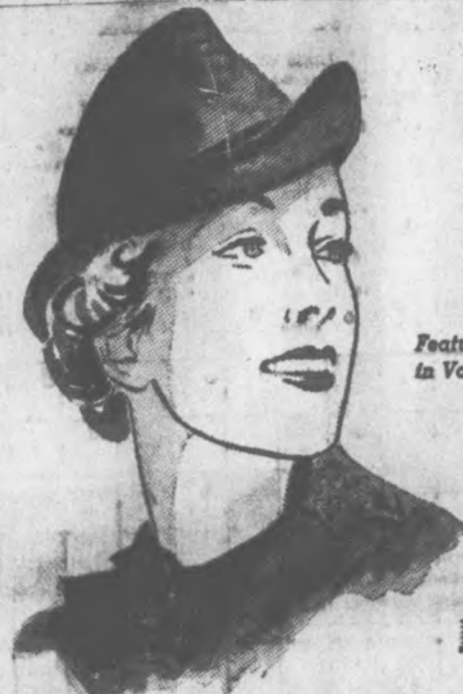
Featured in Vogue

Mount McKinley, Alaska, towers 17,000 feet above timber line.