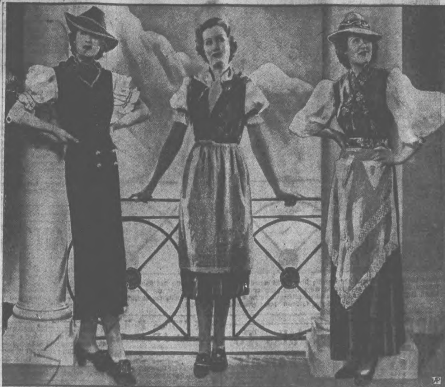
In keeping with the Tyrolean vogue, the costume at left, trimmed with silver cuttoms, combines a black skirt, green belt, white cotton blouse, red bandanna and peasant hat. The youthful Tyrolean peasant pin-afore dress at center is of colorful plaid cotton and sleeves of white cotton.