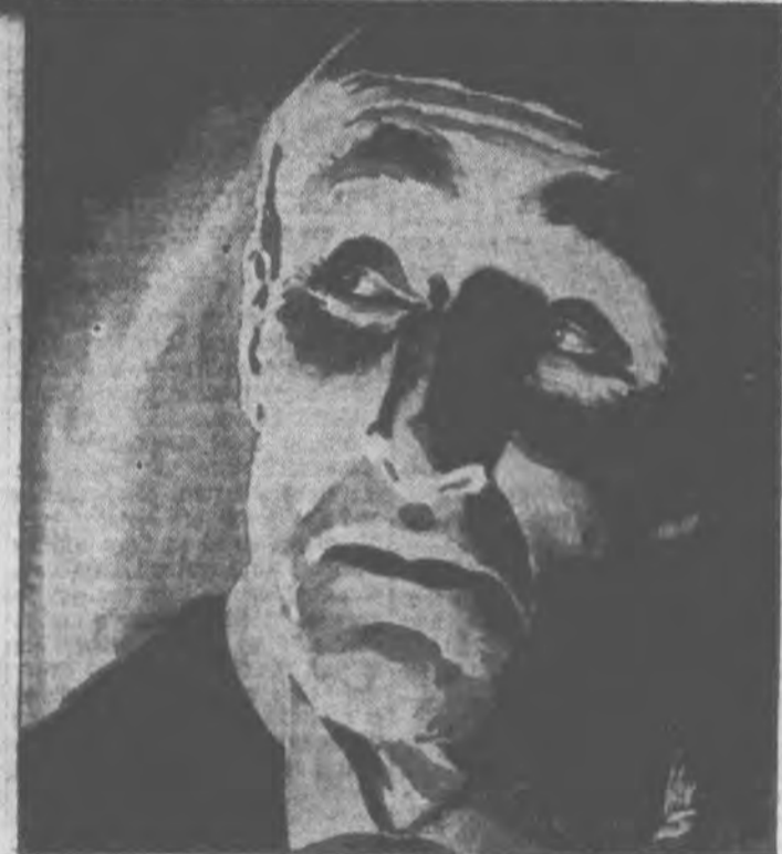
Mullins feared Lee-Ramsden with a mortal terror.

he had been her dead father's best friend.