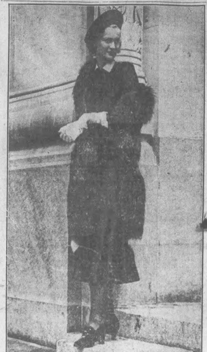
Shoes are higher cut to complement riding helmets and give perfect support to the arch-convex; black suede combined with patent provides the finishing touch for shiny black satin worn with a pair of silver

GUNS—RIFLES—SHELLS—CARtridges—Hunting Coats—Vests—Boots—Shell Belts—Gun Oils and Greases. Fishing Tackle—Tennis Supplies. Low prices at MEEKS' HARDWARE CO. 21-51s