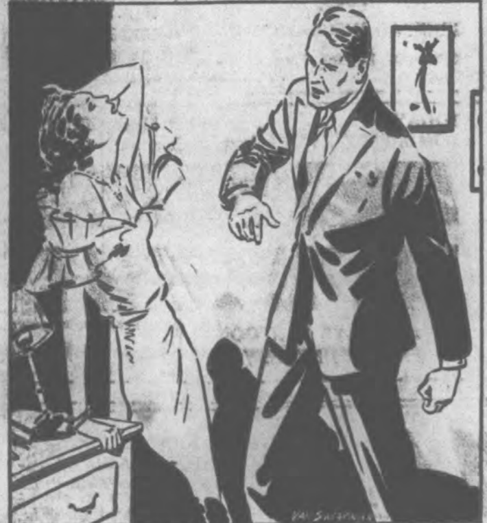
Dread filled her body and mind.

The mark had begun to set, pulling at the flesh of her face—lightening relaxed muscles, the folder said. She stepped from the tub and began to towel herself gently; a sharp dried woman in a grotesque mask. She surveyed herself when the mirror had been removed and decided that she would look very well when she had applied her makeup. She would put it on rather thickly tonight, with only the table lamp lit. And her white chiffon dinner dress with the lavender flowers in it; Blake had seen that, but not on her, and there was no sense in inviting trouble by flaunting the white print.