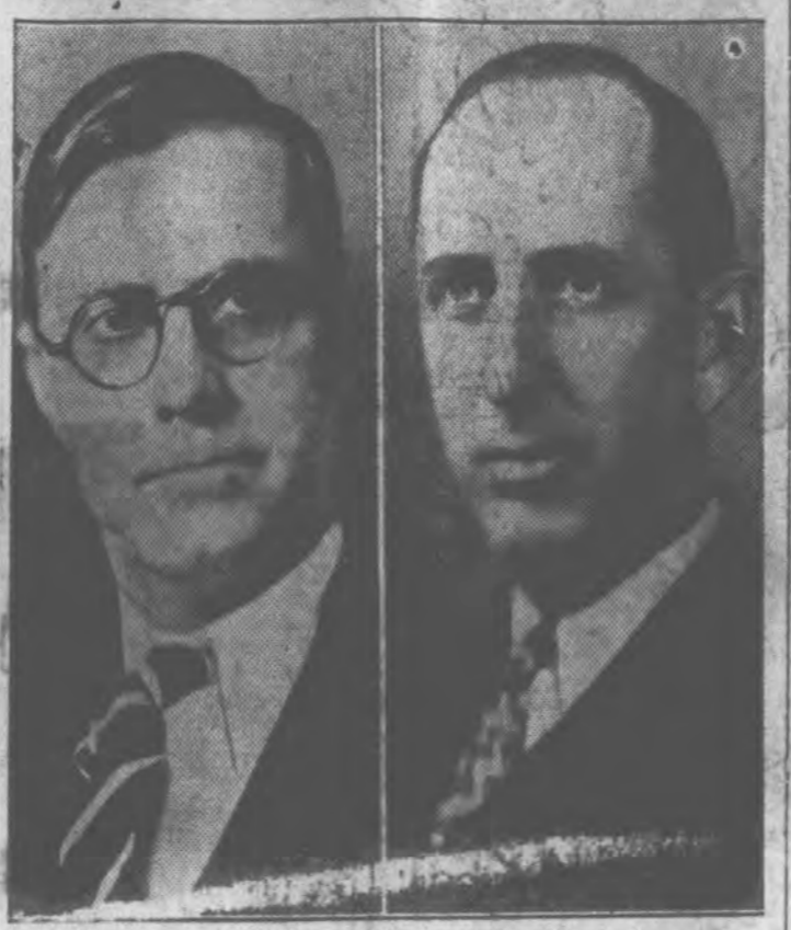
The question whether Georgia will endorse or repudiate the New Deal in the Democratic primary Sept. 9 looms high on the national political horizon. Gov. Eugene Talmadge (left), caustic critic of the Roosevelt administration, seeks nomination for the United States senate in opposition to the incumbent, Senator Richard B. Russell, Jr. (right), vigorous champion of the New Deal.