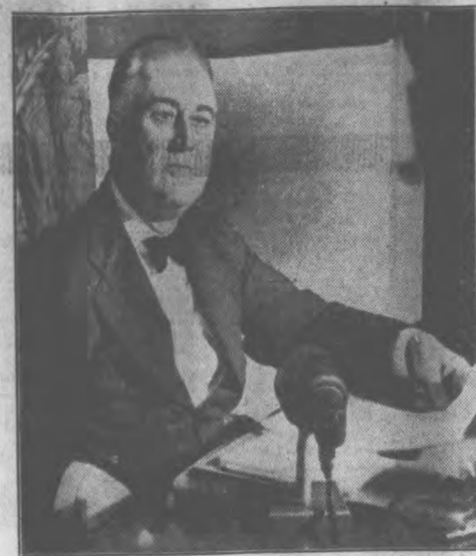
President Roosevelt is seen at his desk in the White House as he told a nationwide audience by radio of his 5,000-mile tour to inspect drought conditions in the west. He disclosed a long-range plan of relief for farmers in the stricken zone.

In the national, not the municipal arena. The extent of his future political activity will depend on how much energy he has left after coping with the mayor's job for four years. Meanwhile he will shoot the works for FDR.