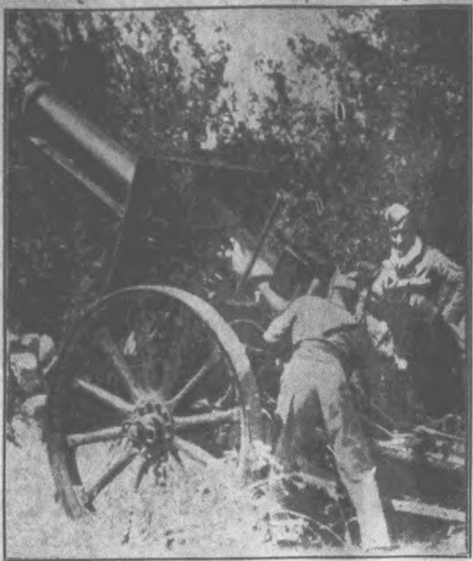
Spanish Loyalists, from a vantage point on the Guadarrama mountain front, hotly contested battleground in Spain's civil war, train a heavy piece of artillery on rebels seeking to advance on Madrid.