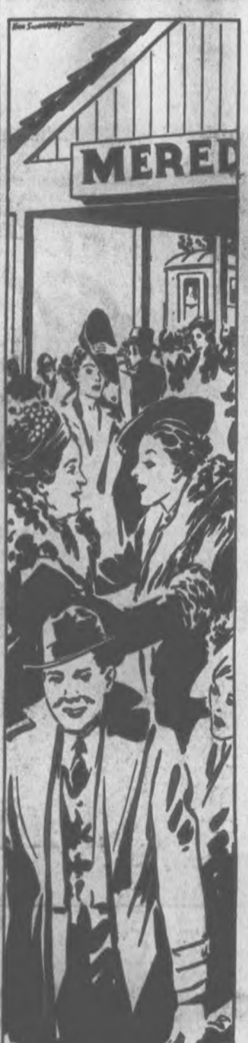
Milly eyed Carol critically.

cold cream carefully and mechanically from her face. Don and Jill. . . .