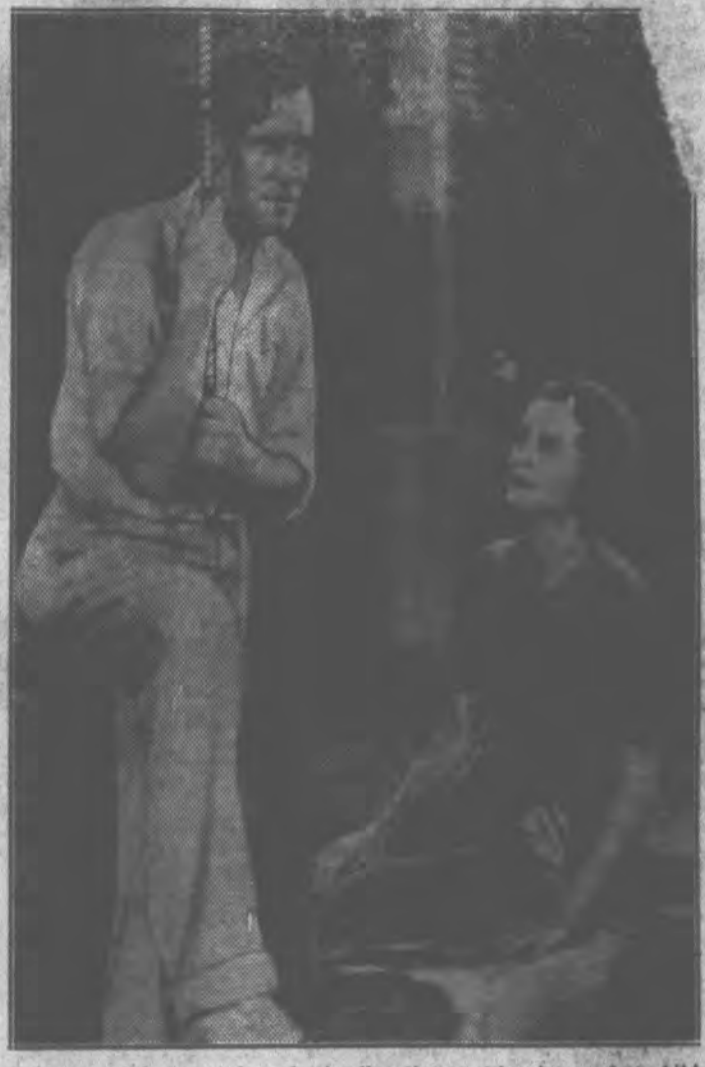
Between making a movie and attending the court hearing on her child custody suit, Actress Mary Astor is a busy person. In a week's recess granted by the court she tried to shoot all the scenes in which she and Walter Huston are together in "Dodsworth." The result was long hours for both. Here Huston and Miss Astor are shown in one of the scenes.