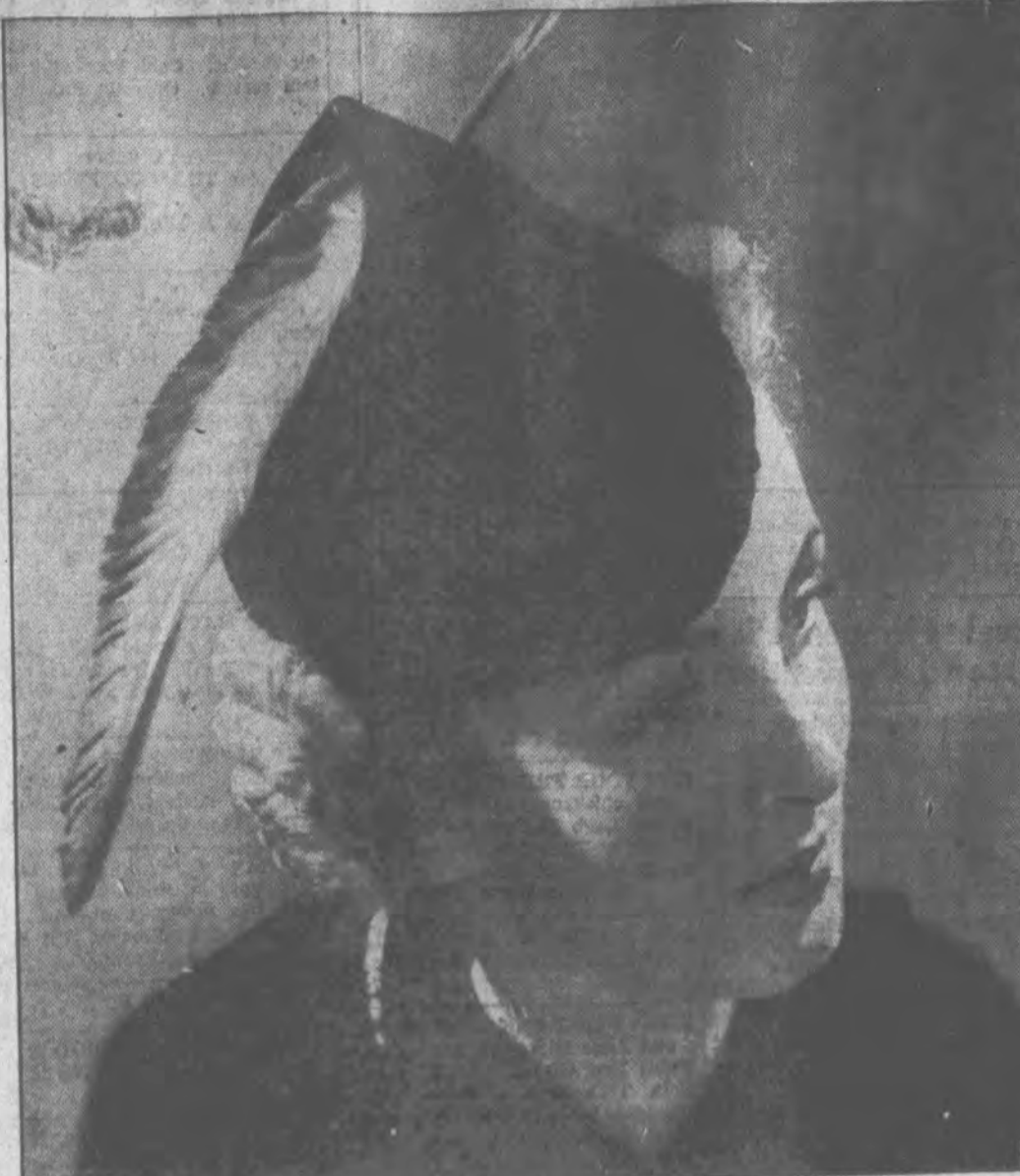
Come fall, say fashion seers, and smart women will wear new high hats such as this. Designed by Sally Victor, its soaring crown of black velvet is pierced with an eagle feather. Tiny, brilliant-hued birds perch on other models of dark fabrics.