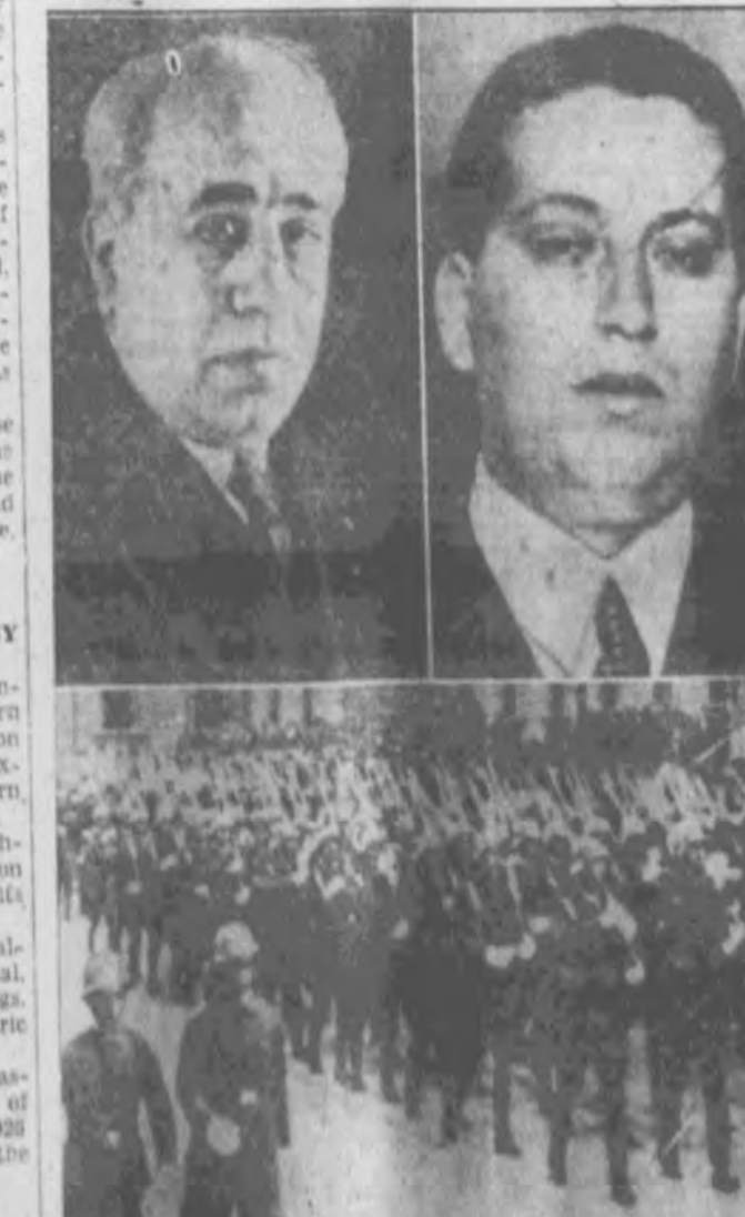
President Manuel Azana (top left) sent troops, warships, and planes to crush a military revolt in Spanish Morocco and the Canary Islands. The revolt was believed inspired by the recent kidnap-murder of Jose Calvo Sotelo (top right), asserted fascist leader. Troops typical of those sent to quell the revolt are shown below being reviewed recently by Azana.