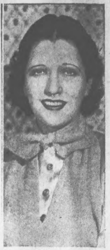
Kay Francis is the heroine in "The White Angel" coming to the Pitt Wednesday and Thursday. She takes the part of the gallant war nurse Florence Nightingale who triumphed over prejudice and scandal to add the helpless and inspire the legion of the Red Cross Nurse. The picture was made by the same producers who gave you "Louis Pasteur."