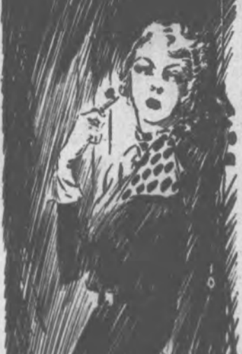
Miss Featherstone at the door.

"Of course," she said, coming to life with a sudden snap. "But it's a little awkward; you see, I'm afraid he isn't quite sober at the moment."