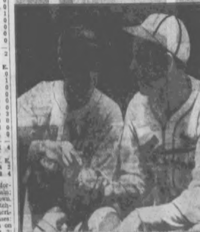
Dizzy Dean (right), credited with the National League's 4-3 victory in the all-star game at Boston, is shown with Joe DiMaggio, New York Yankee rookie whose misdeeds at bat and field made him the "goat" of the classic. DiMaggio's blunders afield figured in two runs for the opposition, and his failure to get a hit in five times at bat led the American Leaguers down in crucial moments.