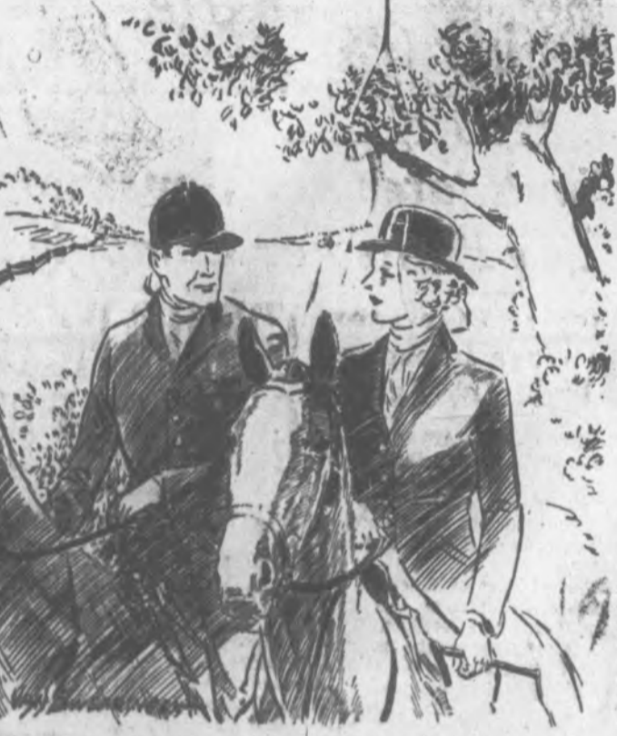
"You haven't said anything to anyone about it?"

CRIM: Indications are that large slices of relief money will go immediately to the West, for relief of drought stricken regions. A terrible danger hangs over those people. If nature doesn't relent, many hundred thousand people will go on relief, with crops and cattle gone, mortgages due, and no assets. A dozen government agencies are gathering facts upon which to base quick action. There's no lack of money—the difficulty is in putting it to mark and effective use. Farm families can't be easily transported. Useful relief works in those regions are scarce. Artificial water supplies can't be furnished in time.