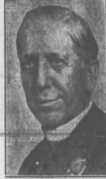
CLYDE R. HOEY