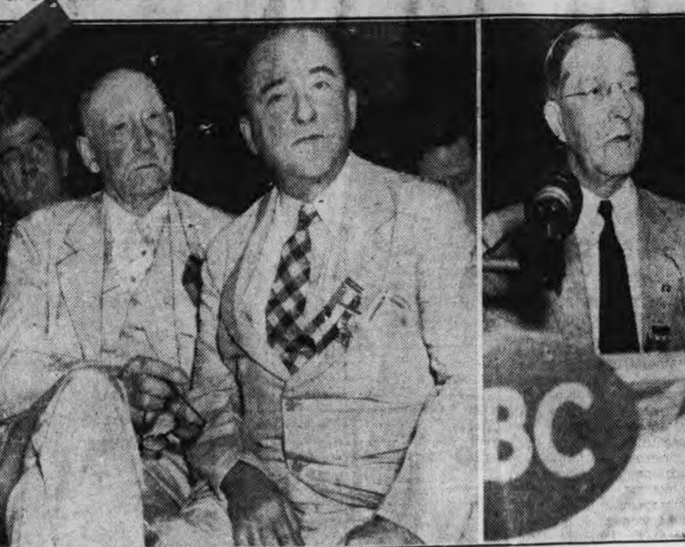
Rep. R. L. Doughton (left) of Laurel Springs, N. C., and Rep. John J. O'Connor are shown listening with all ears as Senator Bailey for re-election. The close-up on the man Doughton is the center of attention when he came out in favor of abolishing the "two-thirds" rule in choosing nominees.