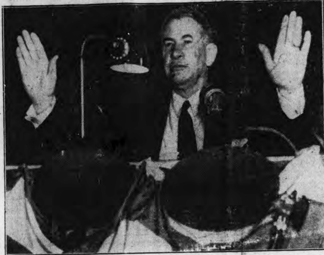
Dramatically throwing the flats of his palms toward his audience, Senator Alben W. Barkley of Kentucky is shown denouncing the opponents of President Roosevelt in his keynote speech to the Democratic National Convention in Philadelphia. He assailed Gov. Landon, the Republican presidential nominee, as an inflationist, attacked the Supreme Court majority for its "distorted interpretation" of the Constitution and pointed to "astounding economic recovery under the New Deal."